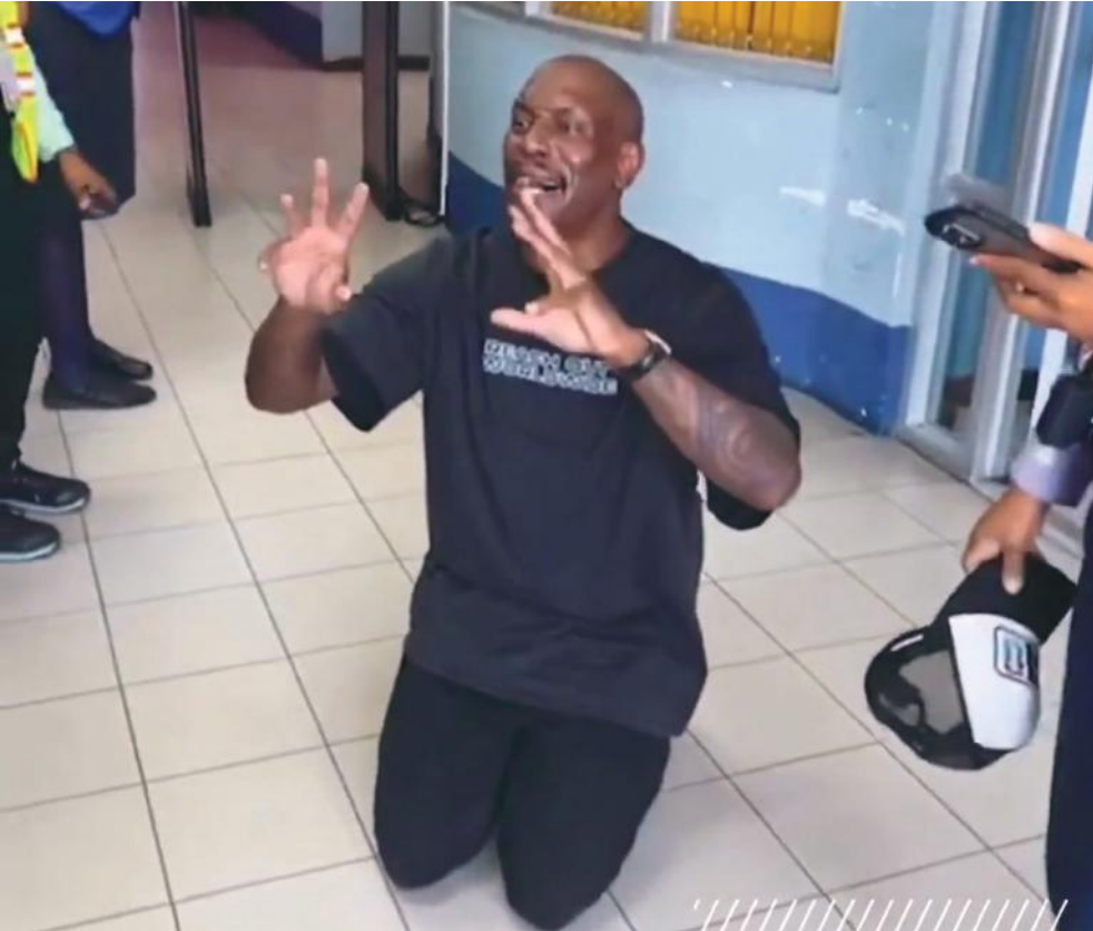
Tyrese Gibson gestures as he arrives in Jamaica

American actor and R&B vocalist, Tyrese Gibson has landed in Jamaica alongside business mogul and television producer Mona Scott-Young to hand out relief packages to victims in hurricane-ravaged parishes. The actor and the entrepreneur