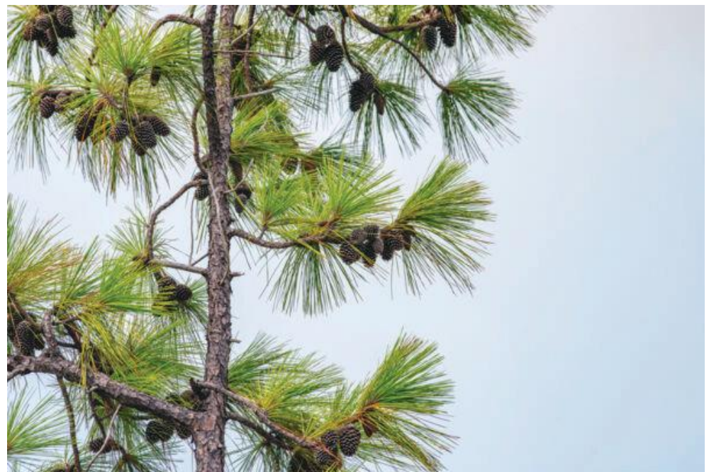
The National Tree, the Caicos Pine

"There must be time on the stage to talk