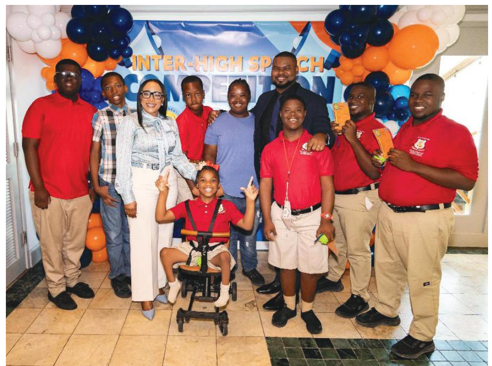
Hon. Jamell Robinson, Deputy Premier, Hon. Rachel Taylor, Minister of Education with the students of the SNAP Center.

dividuals with special needs. As Special Education Month continues, the SENS Department will host a series of activities and outreach initiatives that foster collaboration among families, schools, and organisations, working together as partners in progress to strengthen special education across the Turks and Caicos Islands.