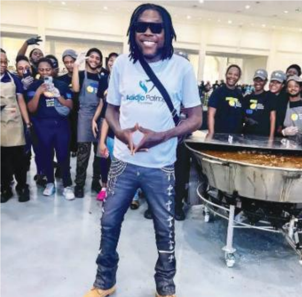
Vybz Kartel on a visit to a World Central Kitchen site in the western Jamaica.

cy response to sustained rebuilding. The entertainer, through the foundation, also plans to adopt one children’s home and rebuild the roof of another, creating safe spaces, including a women’s and kids’ shelter, a soup kitchen, and a dedicated counselling area. Assistance will also be given to a basic school in rebuilding and helping to restore parts of St Elizabeth, the breadbasket parish. After visiting communities affected by the recent hurricane, Vybz Kartel shared heartfelt reflections on the nation’s strength and some of his plans for mental health support. “We’re creating a space where people can get psychological help, because too many — especially the kids — are dealing with trauma. This is not normal, so we have to care for the mind, not just the body. Jamaican people tough like steel, and that’s what hurt me the most; I’ve never seen the people dem cry so much, ever! But the resilience of Jamaican people is second to none. As we always say, ‘We likkle but wi tallawah.’ Right now is the time when we need unity the most. We need that Jamaican strength. The likkle but tallawah energy — activate now,” he said.