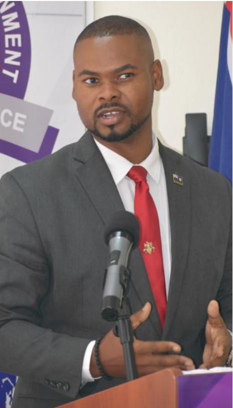
File photo of Deputy Premier and Minister of Immigration Hon. Jamell Robinson

The Deputy Premier noted that the Government’s Digital Borders Initiative is set to modernize entry systems with biometric identity verification, automated e-gates, and enhanced traveler screening. Tender evaluations are in progress, with implementation slated for 2026 and full operational rollout by 2027. In addition, he said upgrades to the ASYCUDA system have reached the project planning phase, with training completed in partnership with CART-AC. The improvements will streamline legitimate trade processing, reinforce border security, and enhance compliance oversight.