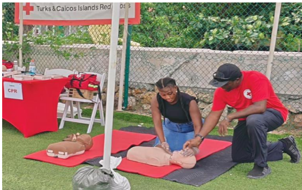
A member off the Grand Turk community takes first aid instructions from a Red Cross Worker.