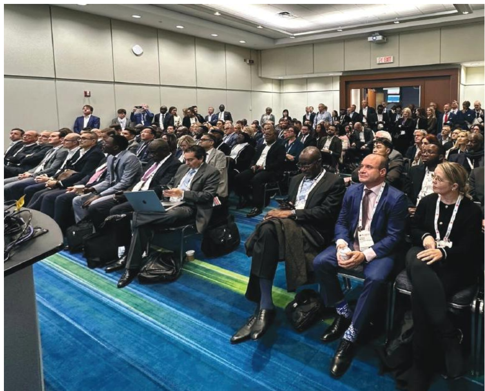
A section of the event