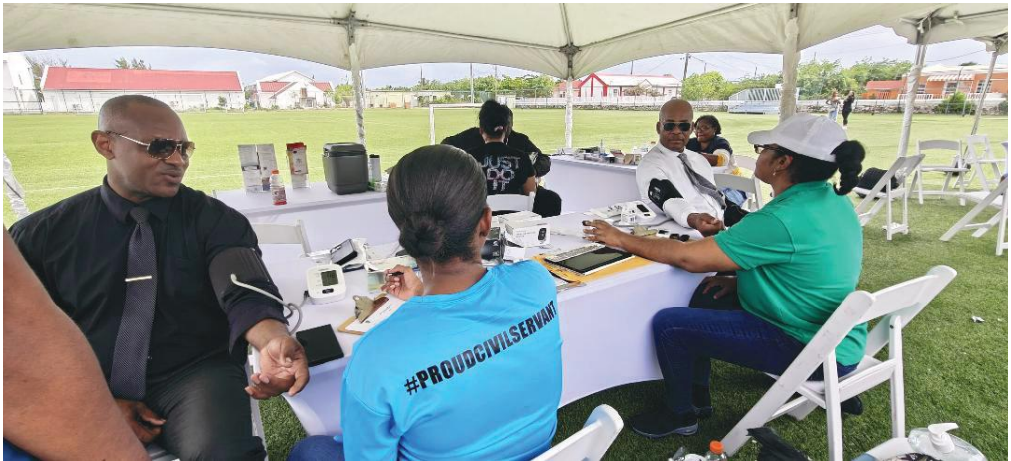
Minister of Public Service and Utility Hon. Otis Morris (left), and Opposition Leader Hon. Edwin Astwood getting their blood pressure checked during the ISU Community Outreach Caravan in Grand Turk.