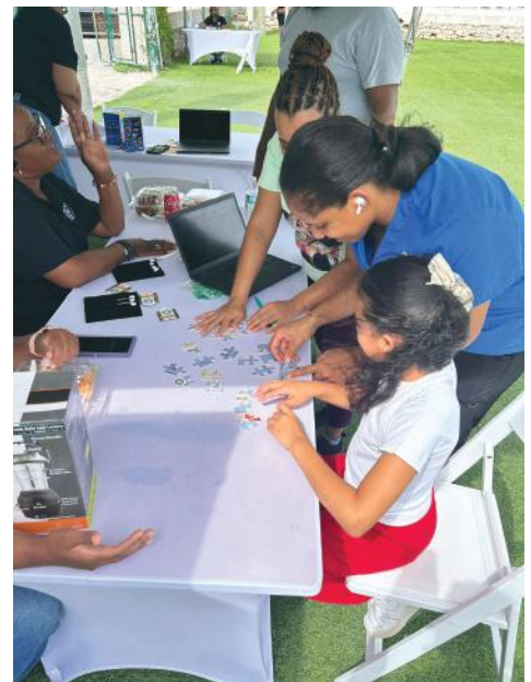
Children participating in solving puzzles

According to feedback received during the event, the Caravan was well-received by residents, who appreciated the opportunity to access all the services on of-