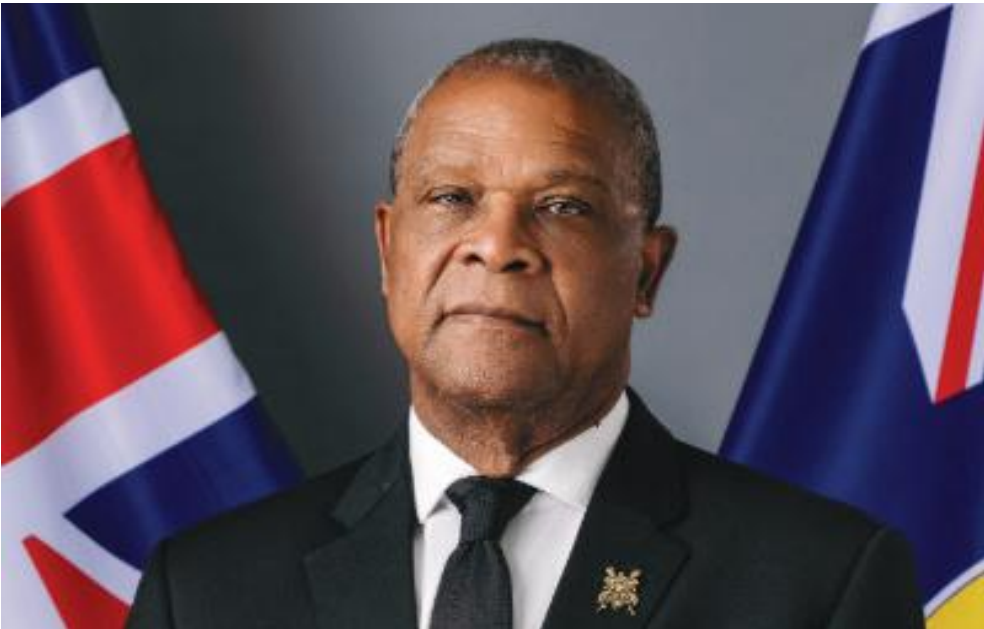
Premier of the Turks and Caicos Islands Washington Misick

pitality, and national security. “Ours is a bond strengthened by shared history, culture, and the countless contributions of Jamaicans to our society,” he stated. “In this spirit of unity and compassion, my government has approved a financial donation of one million U.S. dollars to the government of Jamaica, and we are further calling on our private sector partners to match this contribution in recognition of the vital role the Jamaican workforce plays in our economy.” If met, the combined public and private contributions could total US$2 million in cash support for Jamaica. Premier Misick encouraged those willing to contribute to contact the Office of the Premier for guidance on facilitating donations directly to the Jamaican government. In addition to financial aid, the Turks and Caicos Islands will provide boots on the ground support. The Premier announced the deployment of 16 members of the Turks and Caicos Islands Regiment to assist in on-the-ground disaster relief and recovery efforts. The government is also coordinating with major food suppliers and humanitarian organizations, including Graceway Supermarkets, Sunny Foods, GK Foods, the TCI Red Cross, and the Ministry of Health, to mobilize shipments of food and medical supplies to affected communities in Jamaica.