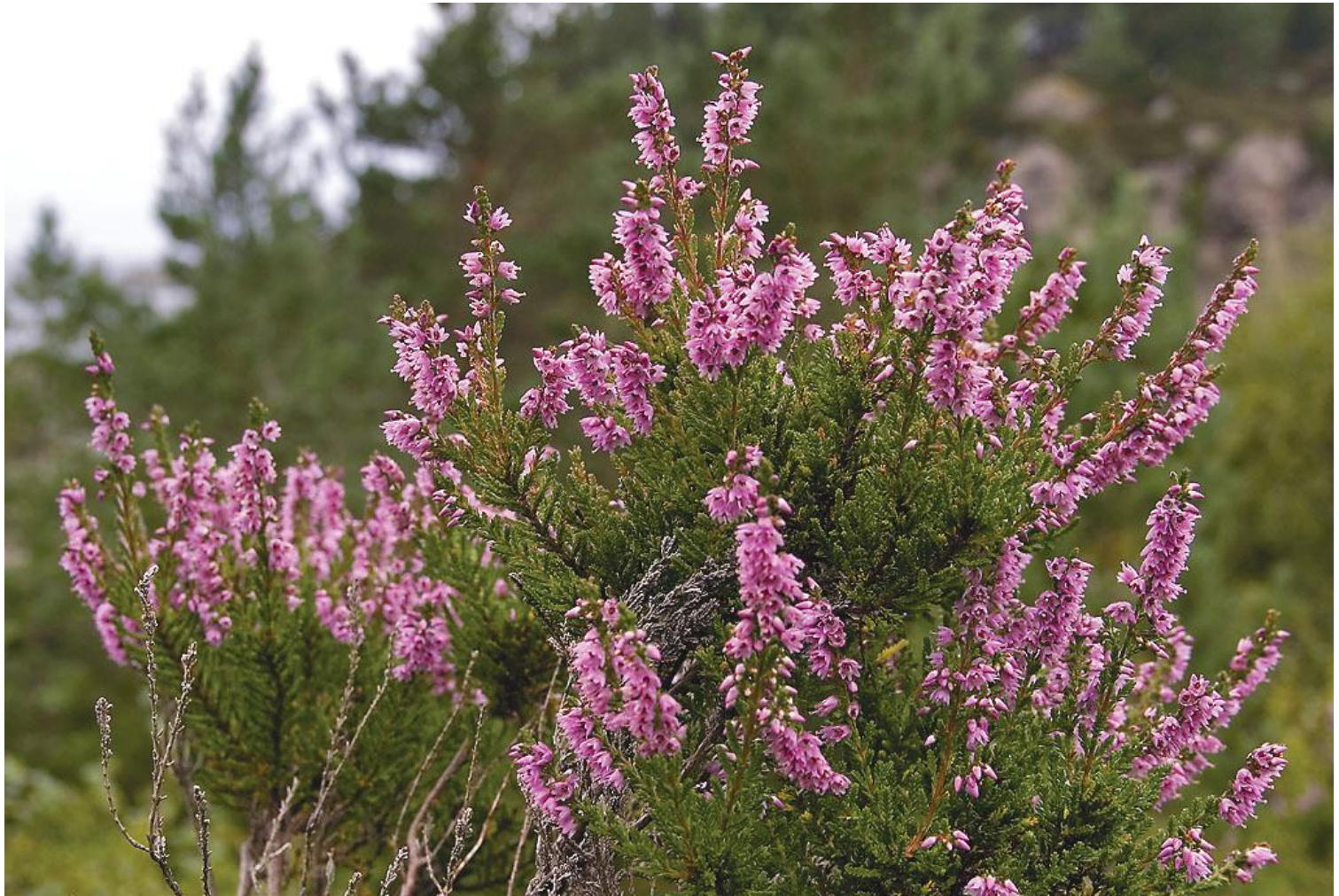
The National Flower the Turks and Caicos Island Heather