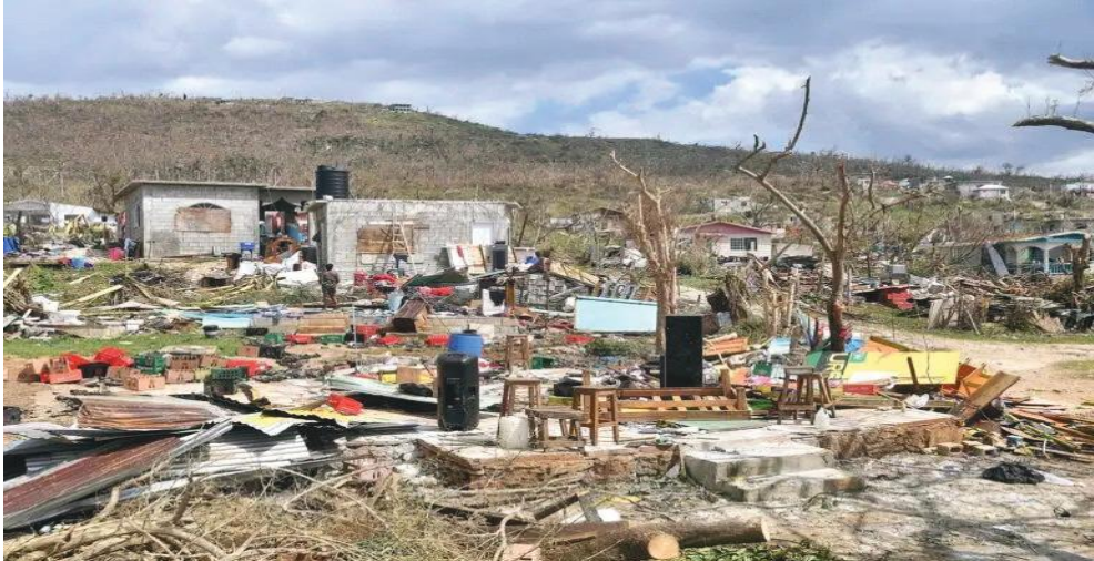
The value of the damage caused by Hurricane Melissa is estimated to be US$6-7 billion.

finance, and logistics would have been inevitable. The severe damage inflicted last year by Hurricane Beryl on St Elizabeth, Westmoreland, Hanover, and St James — even without a direct landfall — was not a near miss. It was a dress rehearsal we failed to fully heed. There is, as always, plenty of blame to go around. But assigning it now is a luxury we cannot afford and a distraction that wastes precious recovery time. The immediate, singular focus must be on a coordinated, unprecedented national effort to build back. Not to what we were, but to what we must become — Jamaica's development miracle. Our membership in the Caribbean Catastrophe Risk Insurance Facility (CCRIF) since 2007 and the development of a catastrophe bond (a first of its kind) could, collectively, provide up to around US$221 million for the National Natural Disaster Reserve Fund (NNDRF) established in June 2024. These instruments provide critical emergency liquidity — the financial first aid to stabilise the patient immediately after the shock. However, as Melissa has brutally demonstrated, these funds are a mere drop in the Caribbean Sea compared to the tropical wave of capital required for reconstruction. They are designed for response, not for rebuilding an entire country's infrastructure,