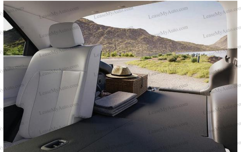
60/40 split-folding 2nd-row seats with recline & slide