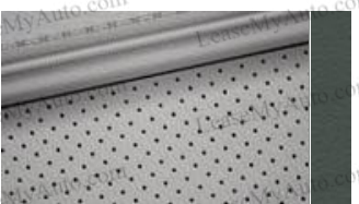
Dark Green 2-Tone H-Tex® Limited