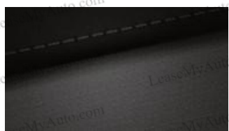
Black Cloth SE