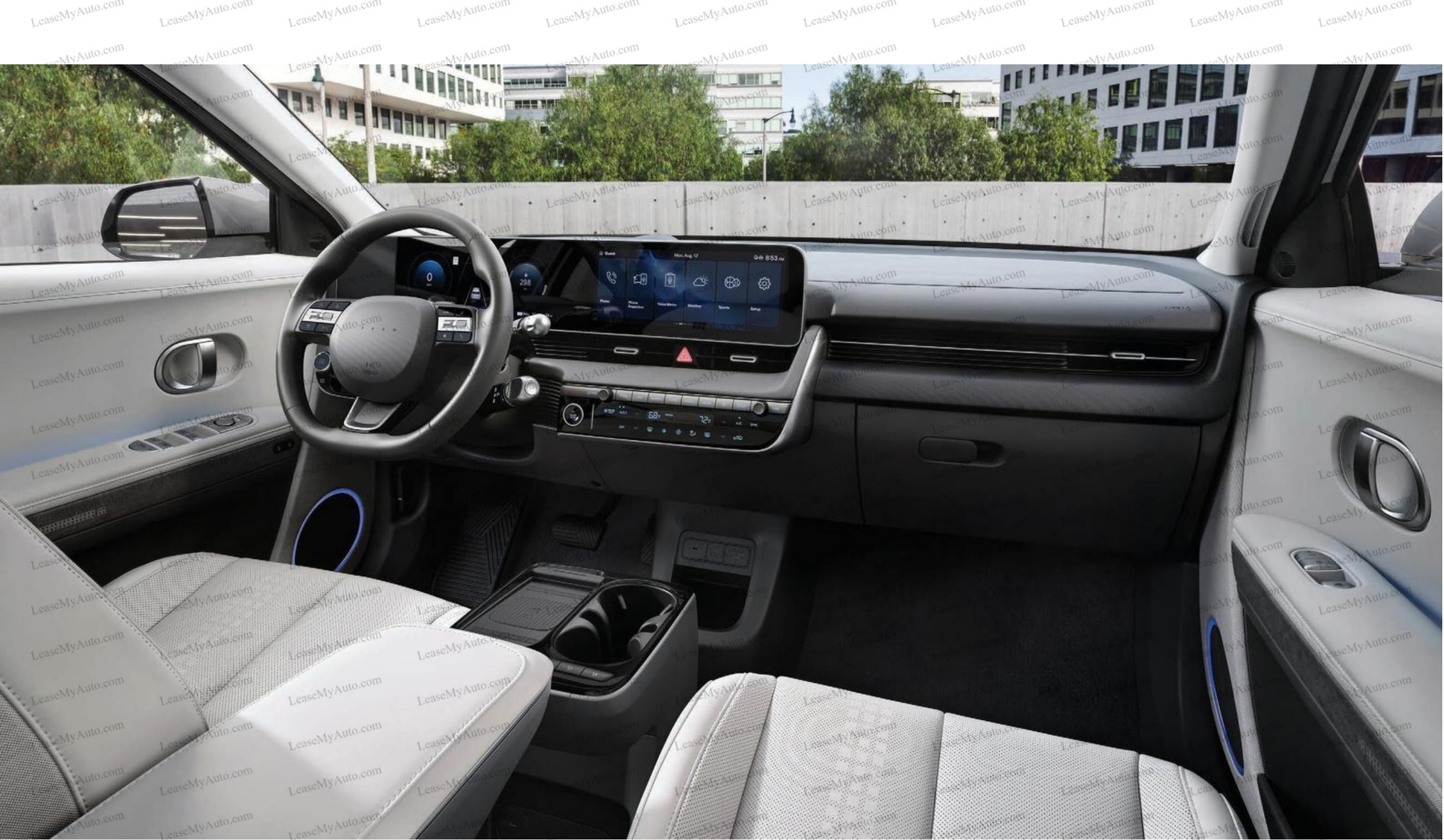
IONIQ 5 Limited in Gray 2-Tone H-Tex®