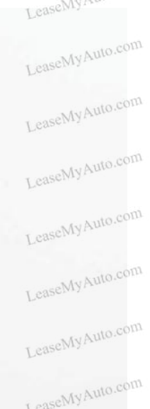
Atlas White Matte Not available on SE/XRT trims