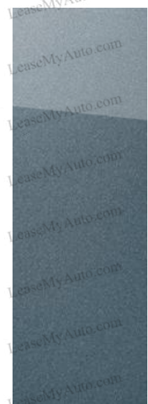
Lucid Blue Pearl Not available on XRT trim