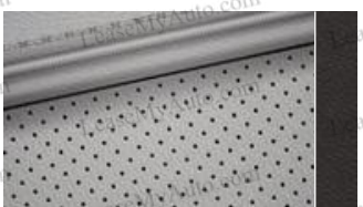
Gray 2-Tone H-Tex® Limited