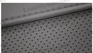
Gray 2-Tone H-Tex® SEL