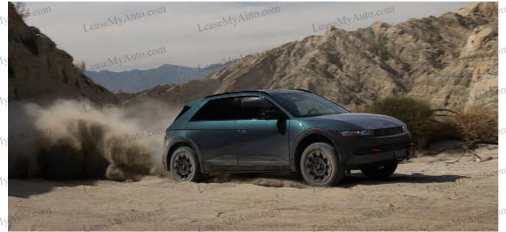
Extra protection with XRT digital camo lower body cladding