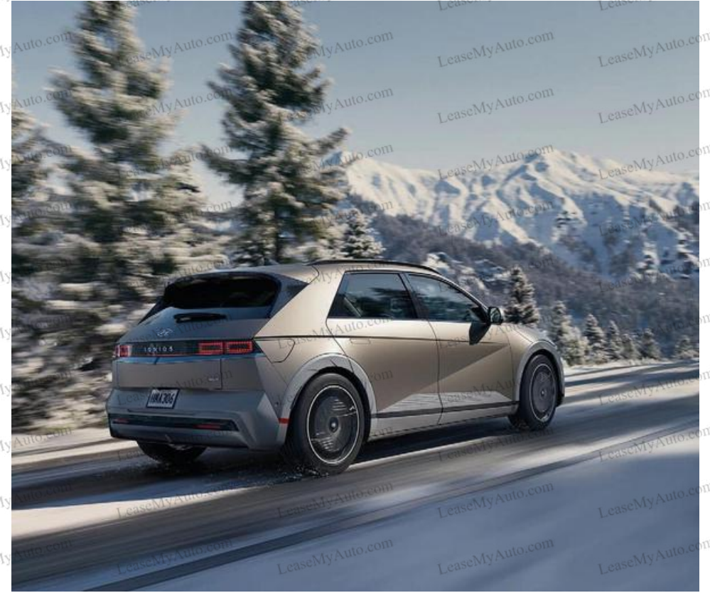
All Wheel Drive with a 320-hp dual-motor electric powertrain

Wherever you go in your Hyundai IONIQ 5, bring your sense of adventure. And bring your electronic toys, too. IONIQ 5's available onboard Vehicle-to-Load (V2L) charger lets you energize e-bikes, game consoles, espresso machines – whatever you want to plug in and power up. 10