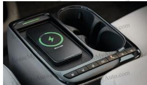
Wireless phone charger