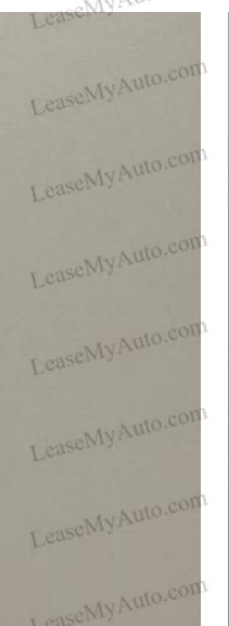
Gravity Gold Matte Available exclusively on Limited trim