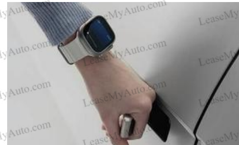
Digital Key 2 Premium