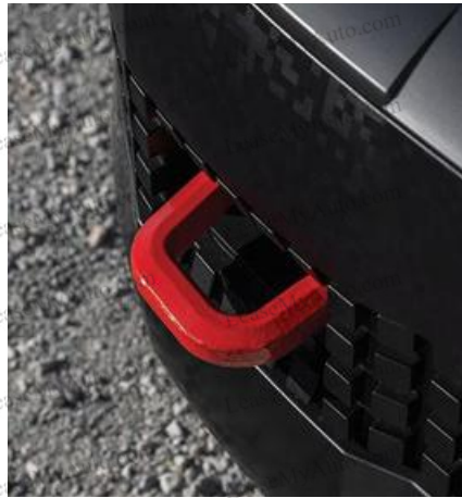
Exclusive XRT red front tow hooks