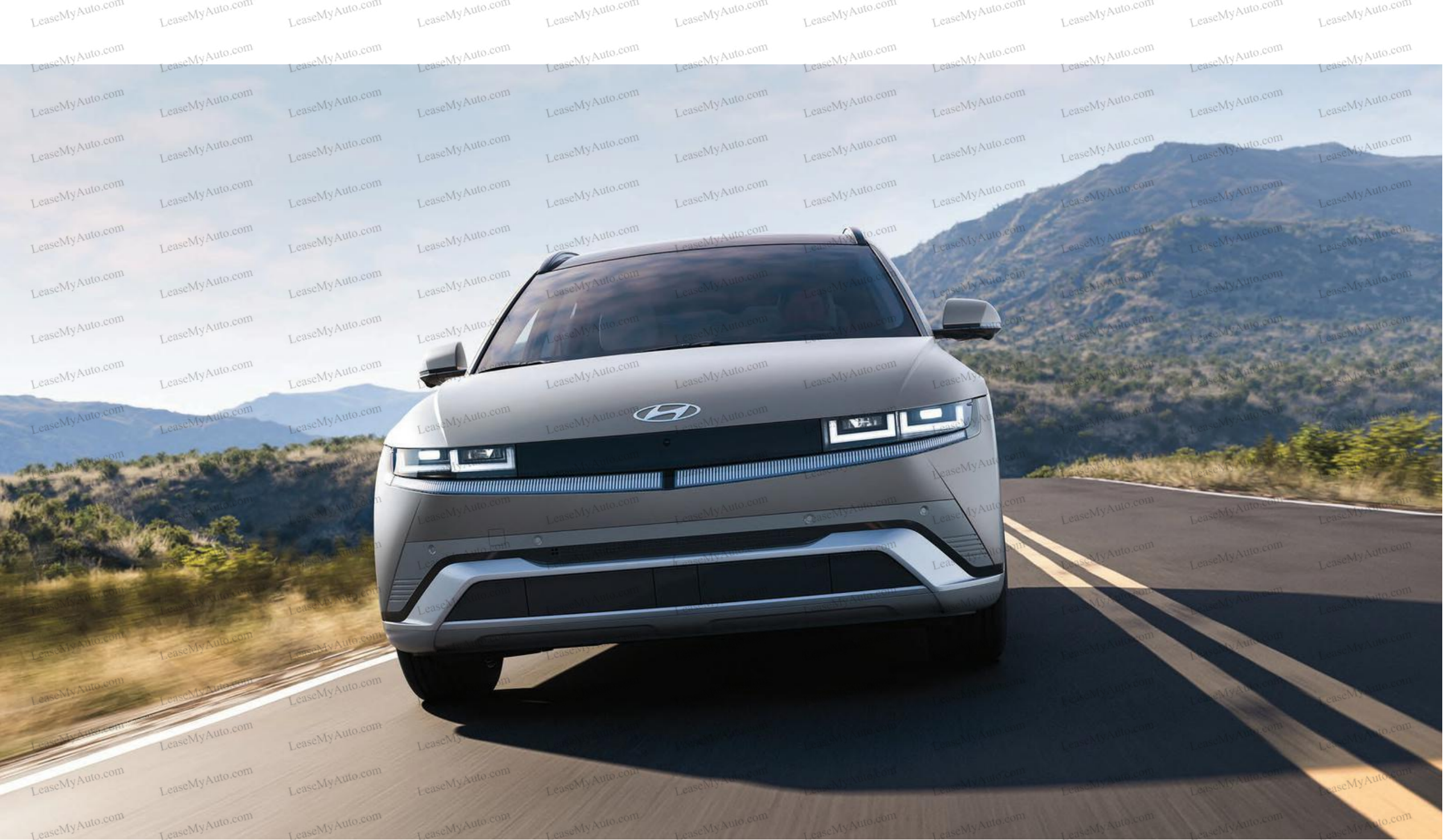
IONIQ 5 Limited AWD in Gravity Gold Matte