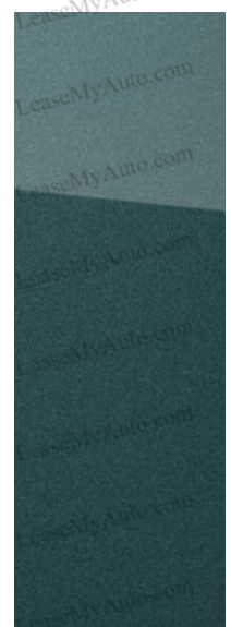
Digital Teal Green Pearl