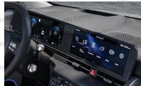
12.3" instrument cluster & touchscreen displays