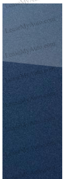
Cosmic Blue Pearl Not available on SE/SEL trims