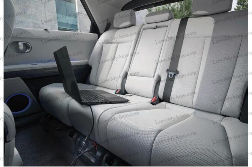
Vehicle-to-Load (V2L) two-way onboard charger

When you want to activate features like the standard heated front seats or available quick-cooling ventilated front seats, smartly sculpted tactile buttons mean you don't have to use a touchscreen. And when you want to welcome in some sunlight, an available glass Vision Roof expands your sense of spaciousness.