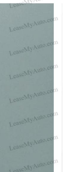
Sage Silver Matte Not available on SE/XRT trims