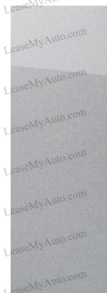
Cyber Gray Metallic