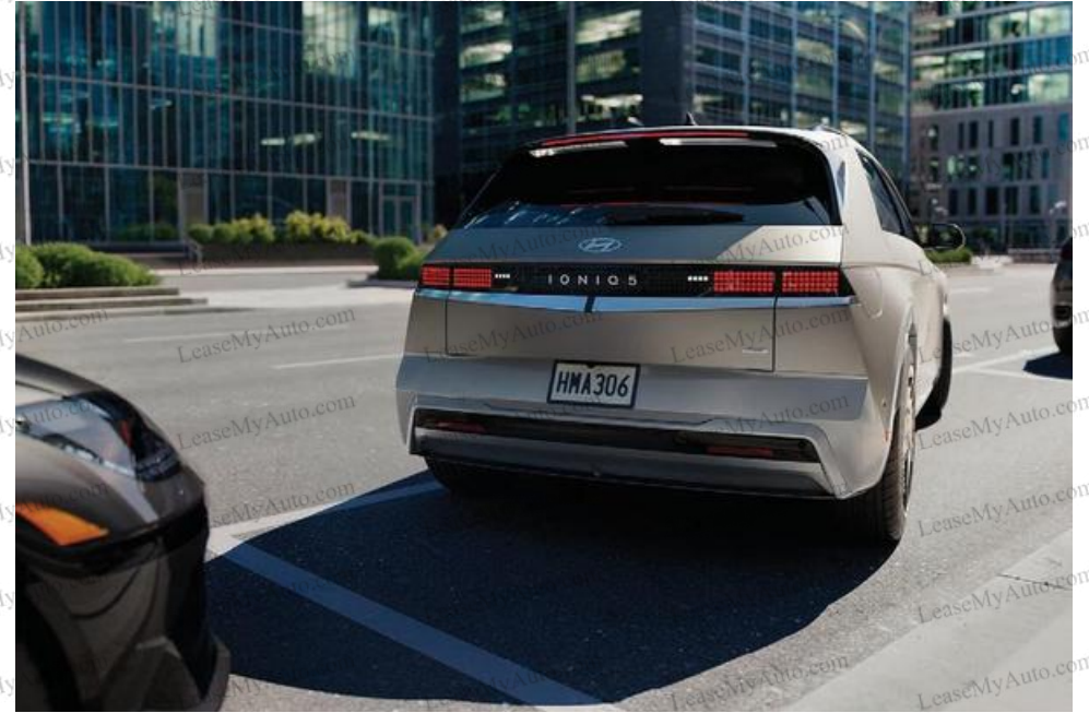
Remote Smart Parking Assist

Everyone can stay plugged in with three standard USB-C ports up front and two ports in the 2nd row. Over-the-Air updates conveniently keep your software up-to-date. When it's time to park or recharge, integrated Hyundai Pay lets you pay for it right from your center console touchscreen.† If parking is tight, available Remote Smart Parking Assist lets you effortlessly roll into or out of parking spots using your key fob as a remote control while standing outside your IONIQ 5. That's genuinely brilliant.