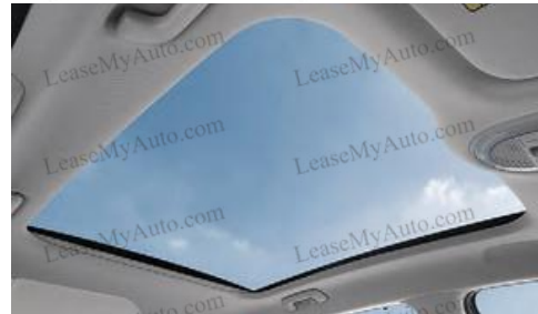
Vision Roof panoramic sunroof