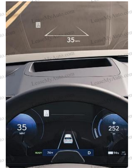
Full-color Head-up Display