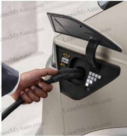
Ultra-fast 800V (350 kW) charging system