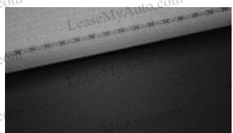
Gray 2-Tone Cloth SE