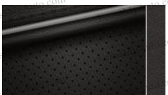
Black H-Tex® Limited