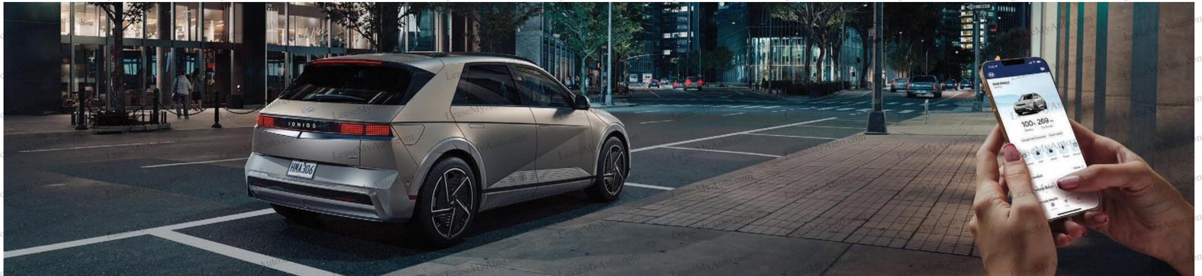
IONIQ 5 Limited AWD in Gravity Gold Matte

Paying to charge or park is easy using the Hyundai Pay feature. It lets you find and complete payments for charging your vehicle or reserving a parking space directly from your vehicle's touchscreen display. 11