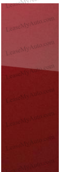
Ultimate Red Metallic Not available on SE trims