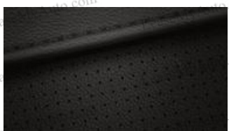
Black H-Tex® SEL / XRT