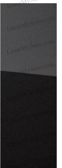
Abyss Black Pearl