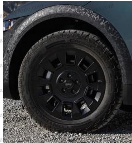
Exclusive 18" XRT wheel design