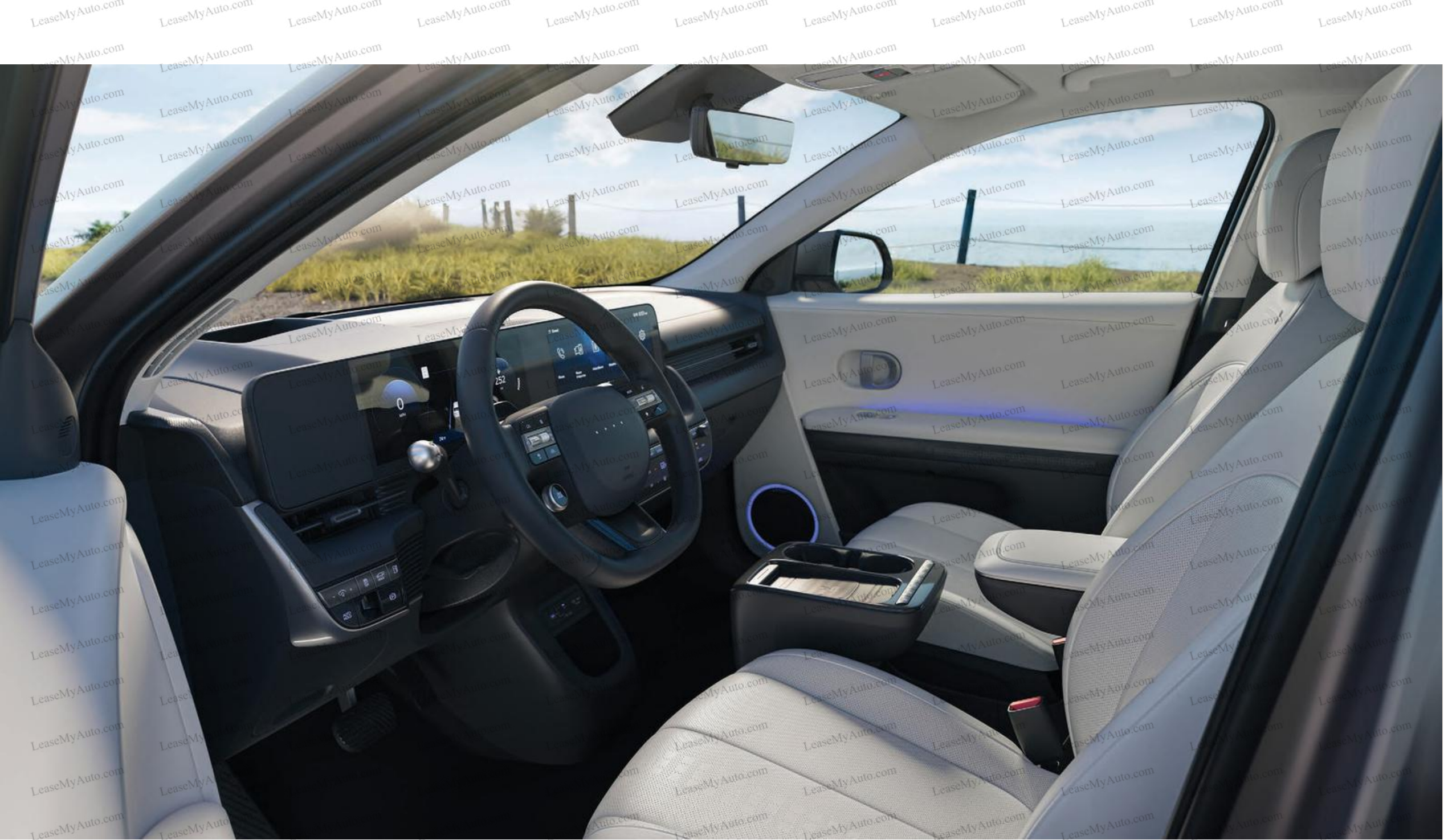
IONIQ 5 Limited in Gray 2-Tone H-Tex®