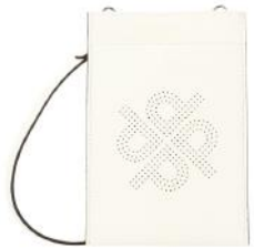
7333 WHITE LILY