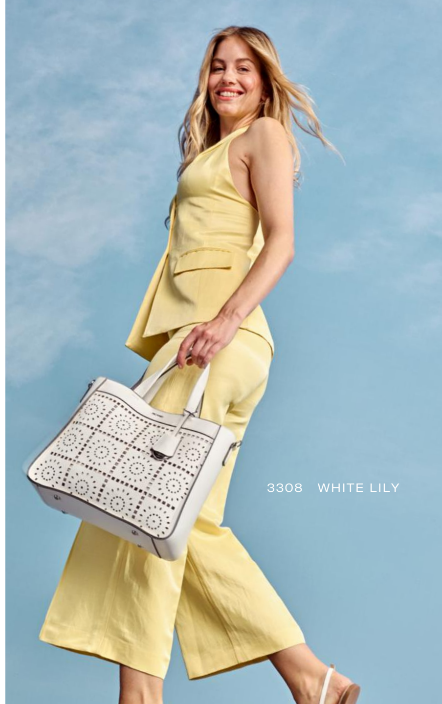
3308 WHITE LILY