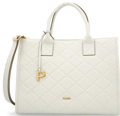
5624 WHITE LILY