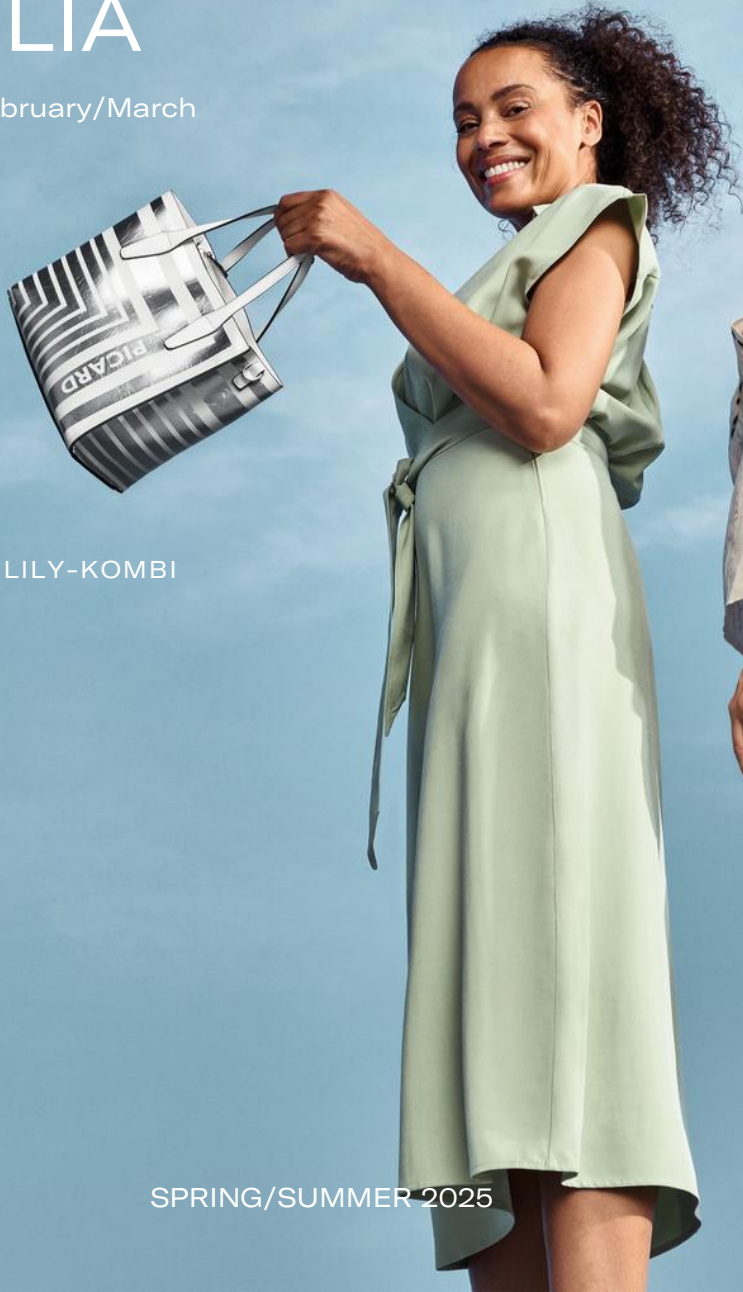
3316 WHITE LILY-KOMBI