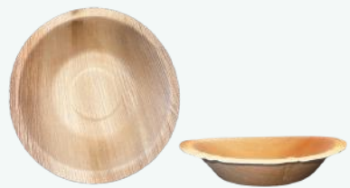
7" ROUND 1.5" DEEP