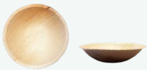
3.75" ROUND 1" DEEP