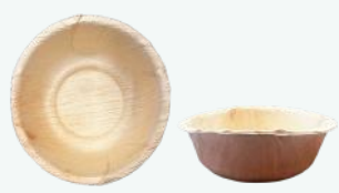
5" ROUND 2" DEEP