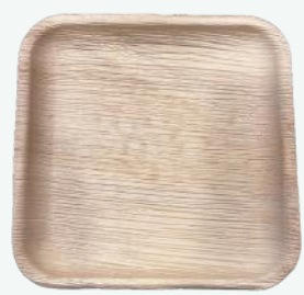
10" x 10" SQUARE