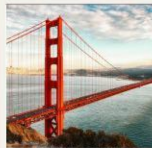
DAY 09: SAN FRANCISCO SEE THE GOLDEN GATE BRIDGE THEN LOMBARD STREET. VISIT THE PALACE OF FINE ARTS. THEN, HAVE A STOP AT FISHERMAN'S WHARF!