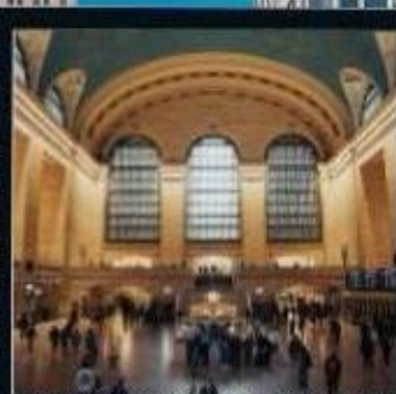
DAY 02: NEW YORK TOUR INCLUDES GRAND CENTRAL, NY PUBLIC LIBRARY, DUMBO, INSTAGRAMMABLE SHOTS AROUND SOHO, CHELSEA MARKET, THE HIGH LINE