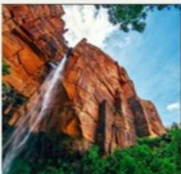
DAY 04: SAN FRANCISCO - YOSEMITE NATIONAL PARK - LOS ANGELES VISIT YOSEMITE NATIONAL PARK ONE OF THE MOST SPECTACULAR PLACES IN THE WORLD