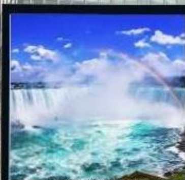
DAY 06: NIAGARA - BOSTON. IN THE MORNING, OBSERVE THE CANADIAN HORSESHOE FALLS (US SIDE), AMERICAN FALLS, GOAT ISLAND, AND BRIDAL VEIL FALLS. IN THE AFTERNOON, CONTINUE BOSTON.