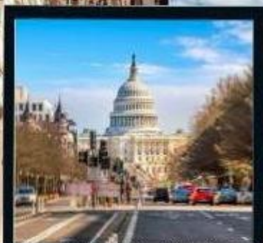
DAY 04: PHILADELPHIA & WASHINGTON DC. NATIONAL INDEPENDENCE HISTORICAL PARK, CAPITOL BUILDING, NATIONAL MALL, WHITE HOUSE, LINCOLN, KOREAN WAR, VIETNAM AND WWII WAR MEMORIALS