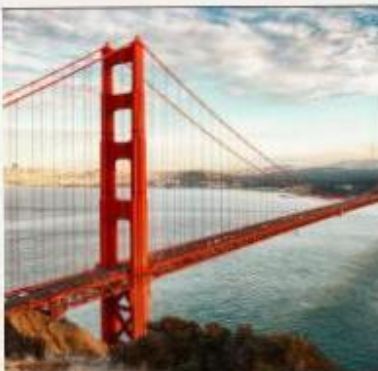
DAY 05: SAN FRANCISCO SEE THE GOLDEN GATE BRIDGE THEN LOMBARD STREET. VISIT THE PALACE OF FINE ARTS. THEN, HAVE A STOP AT FISHERMAN'S WHARF!