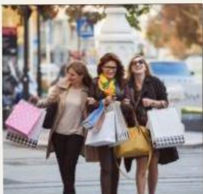
DAY 02: ROUNDRIP TRANSFERS TO/FROM CITADEL OUTLETS. FREE TIME SHOPPING.