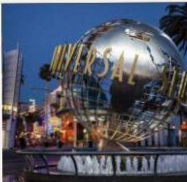
DAY 03: WHOLE DAY OF FUN AT THE UNIVERSAL STUDIOS THEME PARK.