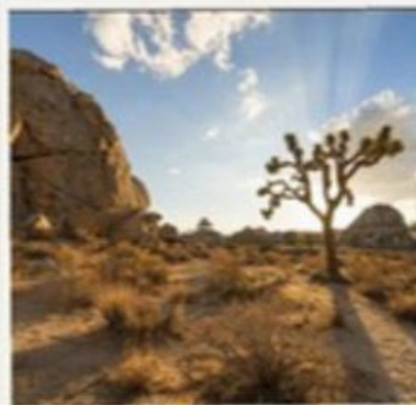
DAY 02: LOS ANGELES - LAS VEGAS LEAVE LOS ANGELES AND DRIVE AT THE MOJAVE DESERT. JOIN LAS VEGAS NIGHT TOUR OR WATCH AWARD WINNING SHOWS AT EXTRA COST