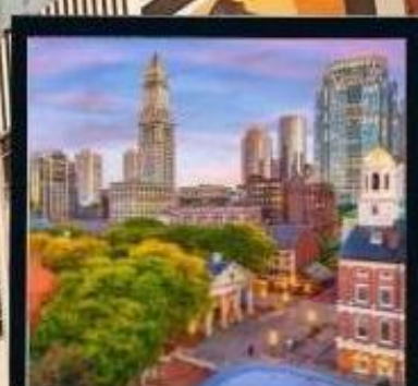
DAY 07: BOSTON - NEW YORK. HARVARD UNIVERSITY & MIT, BOSTON COMMON, TRINITY CHURCH, JOHN HANCOCK TOWER AND QUINCY MARKET. IF SEASON/WEATHER PERMITS, END TOUR WITH A HARBOR CRUISE