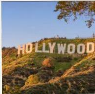
DAY 04: DEPARTURE FROM LOS ANGELES (LAX)