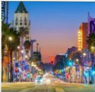
DAY 1: ARRIVAL IN LOS ANGELES