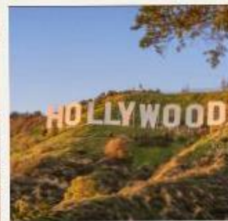
DAY 08: YOSEMITE NATIONAL PARK TOUR BEFORE DEPARTURE FROM LOS ANGELES.