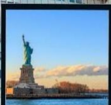
DAY 03: NEW YORK TOUR INCLUDES TRINITY CHURCH, WALL STREET, CHARGING BULL, LIBERTY CRUISE AND TIMES SQUARE