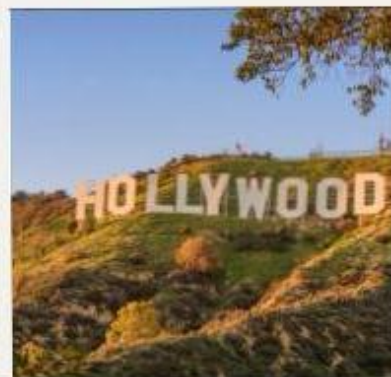
DAY 06: DEPARTURE FROM LOS ANGELES (LAX)