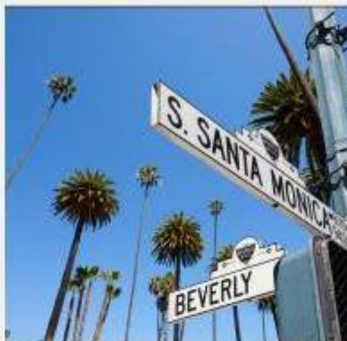
DAY 02: ROUND TRIP TRANSFERS FROM HOTEL TO HOLLYWOOD AREA. EXPLORE LOS ANGELES WITH GOCITY PASS!