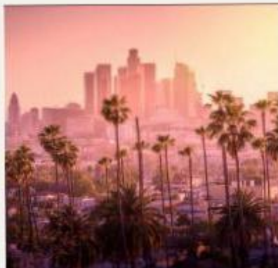
DAY 05: FREE DAY