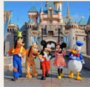
DAY 06: WHOLEDAY OF FUN AT DISNEYLAND THEME PARK