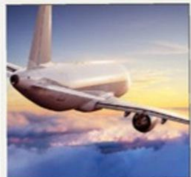
DAY 06: DEPARTURE LOS ANGELES TRANSFER FROM THE HOTEL TO THE AIRPORT FOR YOUR FLIGHT