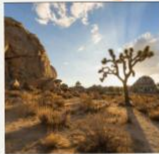
DAY 02: LAS VEGAS ENJOY THE VIEW OF THE MOJAVE DESERT VIEW DURING THE DRIVE TO LAS VEGAS. OPTIONAL: LAS VEGAS NIGHT TOUR