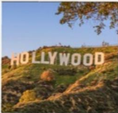
DAY 01: ARRIVAL IN LOS ANGELES TRANSFER TO THE HOTEL FOR CHECK-IN

SATURDAYS, SUNDAYS, MONDAYS, TUESDAYS & WEDNESDAYS