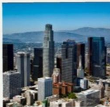
DAY 05: LOS ANGELES Free day