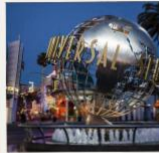
DAY 07: WHOLE DAY OF FUN AT THE UNIVERSAL STUDIOS THEME PARK.