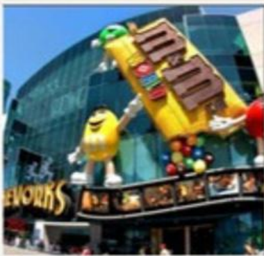
DAY 04: LAS VEGAS - 7 MAGIC MOUNTAINS - LOS ANGELES VISIT M&M LAS VEGAS AND COCA-COLA STORE. TAKE AN ADVENTURE OVER THE 7 MAGIC MT. DRIVE OUTLET AT BARSTOW OVERNIGHT LA