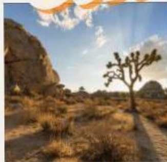
DAY 02: LAS VEGAS ENJOY THE VIEW OF THE MOJAVE DESERT VIEW DURING THE DRIVE TO LAS VEGAS. OPTIONAL: LAS VEGAS NIGHT TOUR