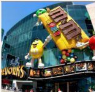
DAY 05: VISIT THE M&M AND COCA COLA STORES IN LAS VEGAS. CONTINUE THE ADVENTURE OVER TO THE SEVEN MAGIC MOUNTAINS. HEAD TO OUTLETS IN BARSTOW FOR SHOPPING. BACK TO LOS ANGELES