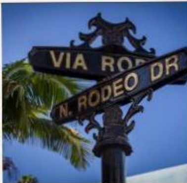
DAY 02: LOS ANGELES. HEAD TO OLCERA STREET. SEE THE WORLD FAMOUS HOLLYWOOD WALK OF FAME. PASS BY RODEO DRIVE AND STOP BY BEVERLY CENTER FOR SHOPPING. FINALLY, VISIT THE GETTY CENTER