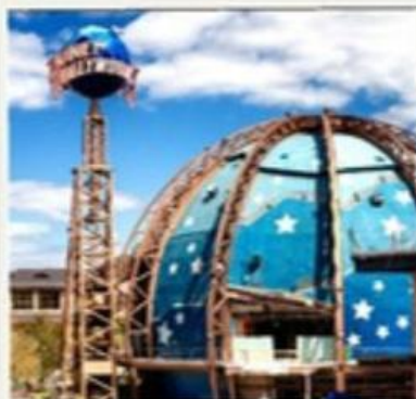
DAY 05: LOS ANGELES - UNIVERSAL STUDIO HOLLYWOOD MORNING DRIVER PICKS UP GUESTS AT THE HOTEL TO TRANSFER TO UNIVERSAL STUDIO