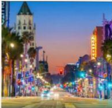
DAY 1: ARRIVAL IN LOS ANGELES