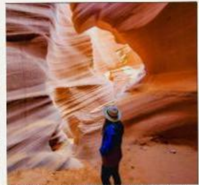
DAY 03: GUIDED TOUR OF THE LOWER ANTELOPE AND VISIT TO THE HORSESHOE BEND