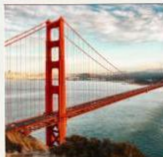
DAY 07: SAN FRANCISCO SEE THE GOLDEN GATE BRIDGE THEN LOMBARD STREET. VISIT THE PALACE OF FINE ARTS. THEN, HAVE A STOP AT FISHERMAN'S WHARF!