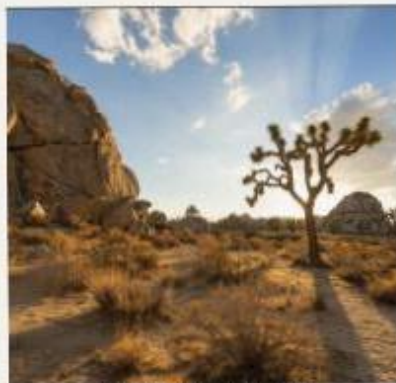
DAY 02: LAS VEGAS ENJOY THE VIEW OF THE MOJAVE DESERT VIEW DURING THE DRIVE TO LAS VEGAS. OPTIONAL: LAS VEGAS NIGHT TOUR