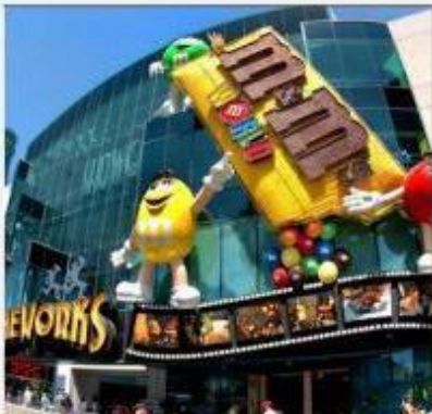
DAY 04: VISIT THE M&M AND COCA COLA STORES IN LAS VEGAS. CONTINUE THE ADVENTURE OVER TO THE SEVEN MAGIC MOUNTAINS. HEAD TO OUTLETS IN BARSTOW FOR SHOPPING. BACK TO LOS ANGELES