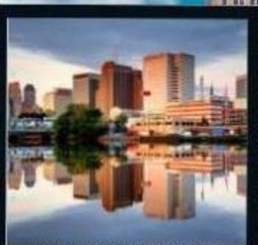
DAY 01: ARRIVAL VIA JOHN F. KENNEDY (JFK) / LAGUARDIA (LGA) / NEWARK LIBERTY (EWR) AIRPORT. FOR BEST SERVICE, PLEASE CHOOSE EWR AIRPORT.