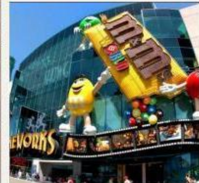
DAY 06: VISIT THE M&M AND COCA COLA STORES IN LAS VEGAS. CONTINUE THE ADVENTURE OVER TO THE SEVEN MAGIC MOUNTAINS. HEAD TO OUTLETS IN BARSTOW FOR SHOPPING. BACK TO LOS ANGELES