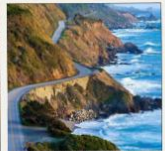
DAY 08: TRAVEL TO SAN FRANCISCO. SEE THE PICTURESQUE MONTEREY PENINSULA. STOP BY THE WORLD'S FIRST CLASS GOLF COURSE RESORT. DISCOVER AN AMAZING OCEAN VIEW AND MANSIONS THEN PASS BY 17 MILE DRIVE