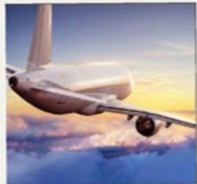
DAY 06: DEPARTURE FROM LOS ANGELES (LAX) TRANSFER TO THE AIRPORT FOR YOUR FLIGHT