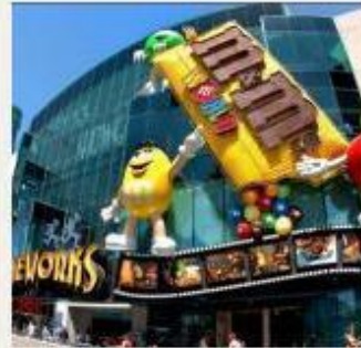
DAY 05: VISIT THE M&M AND COCA COLA STORES IN LAS VEGAS. CONTINUE THE ADVENTURE OVER TO THE SEVEN MAGIC MOUNTAINS. HEAD TO OUTLETS IN BARTSTOW FOR SHOPPING. BACK TO LOS ANGELES