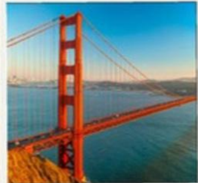
DAY 03: SAN FRANCISCO CITY TOUR OF THE AREA. VISIT GOLDEN GATE BRIDGE, PALACE OF FINE ART, LOMBARD STREET, FISHERMAN'S WHARF