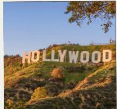
DAY 06: DEPARTURE FROM LOS ANGELES (LAX)