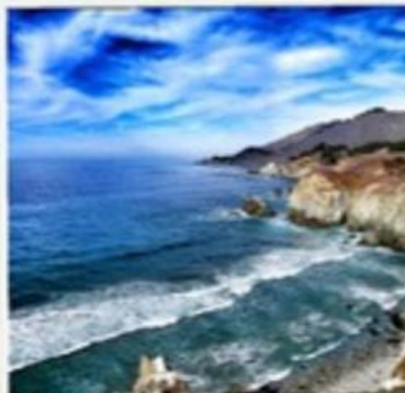
DAY 02: LA - 17 MILE DRIVE - SAN FRANCISCO DEPART FROM LOS ANGELES TO MONTEREY PENINSULA, SEA BREEZES SURGING WAVES BIZARRE ROCKS AND ADORABLE SEALS WITH SEA LIONS OVERNIGHT SAN FRANCISCO