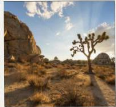
DAY 03: LAS VEGAS ENJOY THE VIEW OF THE MOJAVE DESERT VIEW DURING THE DRIVE TO LAS VEGAS. OPTIONAL: LAS VEGAS NIGHT TOUR