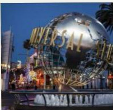
DAY 05: ROUNDTrip TRANSFERS TO/FROM UNIVERSAL STUDIOS