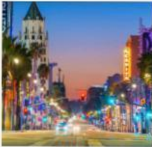
DAY 1: ARRIVAL IN LOS ANGELES