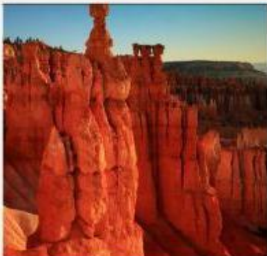
DAY 04: LAS VEGAS - ZION NATIONAL PARK - BRYCE CANYON NATIONAL PARK - PAGE TRANSFER TO UTAH AND VISIT ZION NATIONAL PARK. STOP BY CHECKERBOARD MESA. AFTER, HEAD TO BRYCE CANYON NATIONAL PARK.