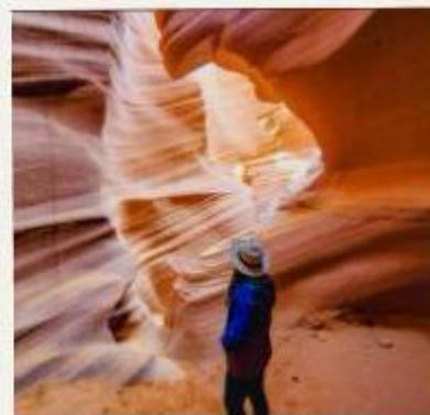
DAY 03: GUIDED TOUR OF THE LOWER ANTELOPE AND VISIT TO THE HORSESHOE BEND