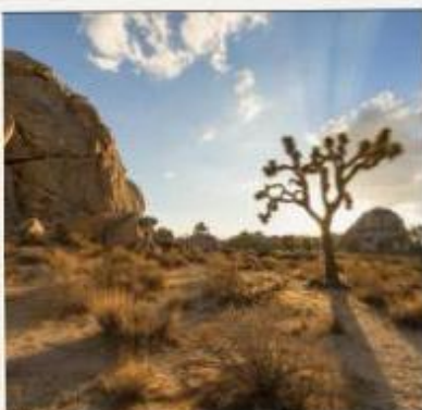
DAY 02: LAS VEGAS ENJOY THE VIEW OF THE MOJAVE DESERT VIEW DURING THE DRIVE TO LAS VEGAS. OPTIONAL: LAS VEGAS NIGHT TOUR