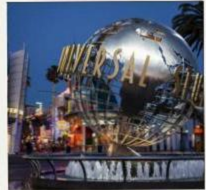
DAY 03: WHOLE DAY OF FUN AT THE UNIVERSAL STUDIOS THEME PARK.