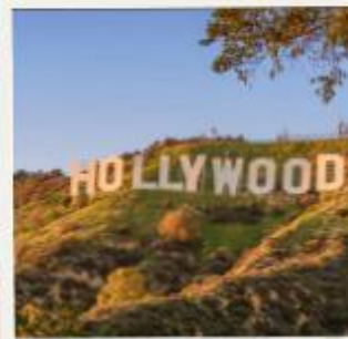
DAY 10: YOSEMITE NATIONAL PARK TOUR BEFORE DEPARTURE FROM LOS ANGELES.