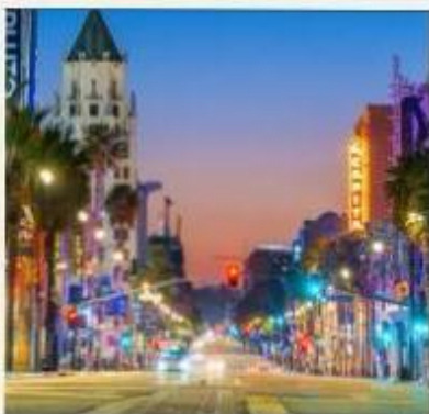
DAY 1: ARRIVAL IN LOS ANGELES