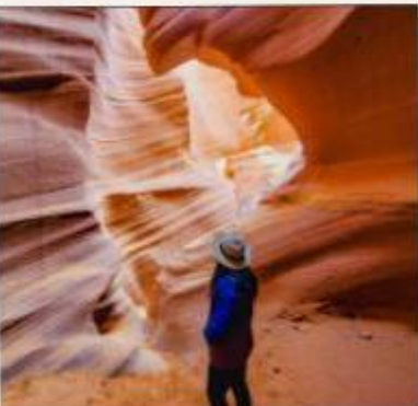
DAY 05: ANTELOPE CANYON - HORSESHOE BEND - LAS VEGAS. HAVE AN EXCURSION AT HORSHOE BEND AND THEN SEE LAKE POWELL