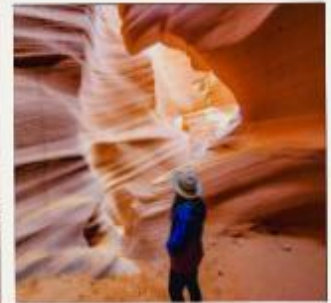
DAY 04: ANTELOPE CANYON - HORSESHOE BEND - LAS VEGAS. OPTIONAL ANTELOPE CANYON TOUR. A VISIT AT LAKE POWELL