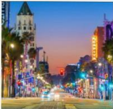
DAY 1: ARRIVAL IN LOS ANGELES