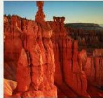
DAY 06: LAS VEGAS - ZION NATIONAL PARK - BRYCE CANYON NATIONAL PARK - PAGE TRANSFER TO UTAH AND VISIT ZION NATIONAL PARK. STOP BY CHECKERBOARD MESA. AFTER, HEAD TO BRYCE CANYON NATIONAL PARK.