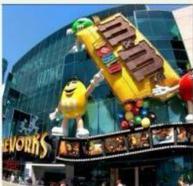
DAY 04: VISIT THE M&M AND COCA COLA STORES IN LAS VEGAS. CONTINUE THE ADVENTURE OVER TO THE SEVEN MAGIC MOUNTAINS. HEAD TO OUTLETS IN BARSTOW FOR SHOPPING. BACK TO LOS ANGELES