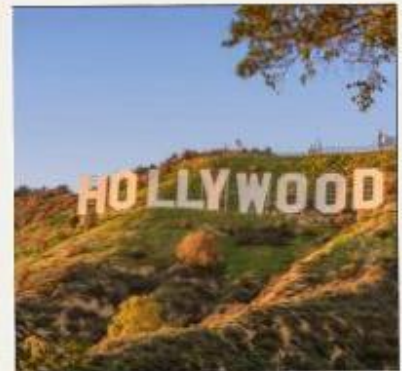
DAY 06: YOSEMITE NATIONAL PARK TOUR BEFORE DEPARTURE FROM LOS ANGELES.