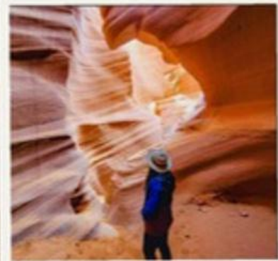
DAY 03: LAS VEGAS - ANTELOPE CANYON - HORSESHOE BEND - LAS VEGAS TRAVEL TO LOWER ANTELOPE CANYON AND HORSESHOE BEND FOLLOW LOCAL NAVAJO GUIDE