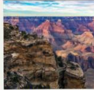
DAY 03: HAVE AN EXCURSION AT SOUTH RIM GRAND CANYON THEN THE EAST RIM GRAND CANYON. DISCOVER HORSESHOE BEND BEFORE HEADING TO PAGE