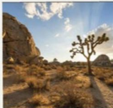
DAY 02: LOS ANGELES - LAS VEGAS LEAVE LOS ANGELES AND DRIVE AT THE MOJAVE DESERT. JOIN LAS VEGAS NIGHT TOUR OR WATCH AWARD WINNING SHOWS AT EXTRA COST