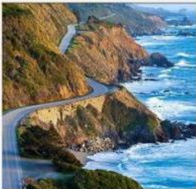
DAY 04: LOS ANGELES - SAN FRANCISCO TRAVEL TO SAN FRANCISCO AND SEE THE PICTURESQUE MONTEREY PENINSULA. STOP BY THE WORLD'S FIRST CLASS GOLF COURSE RESORT AND DISCOVER AN AMAZING OCEAN VIEW AND MANSIONS THEN PASS BY 17 MILE DRIVE