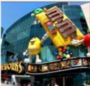
DAY 04: LAS VEGAS - 7 MAGIC MOUNTAINS - LOS ANGELES VISIT M&M LAS VEGAS AND COCA-COLA STORE. TAKE AN ADVENTURE OVER THE 7 MAGIC MT. DRIVE OUTLET AT BARSTOW OVERNIGHT LA