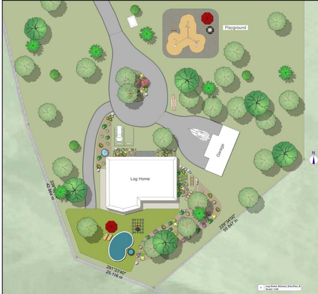
1 Log Home Retreat, Site Plan B Scale: 1:50