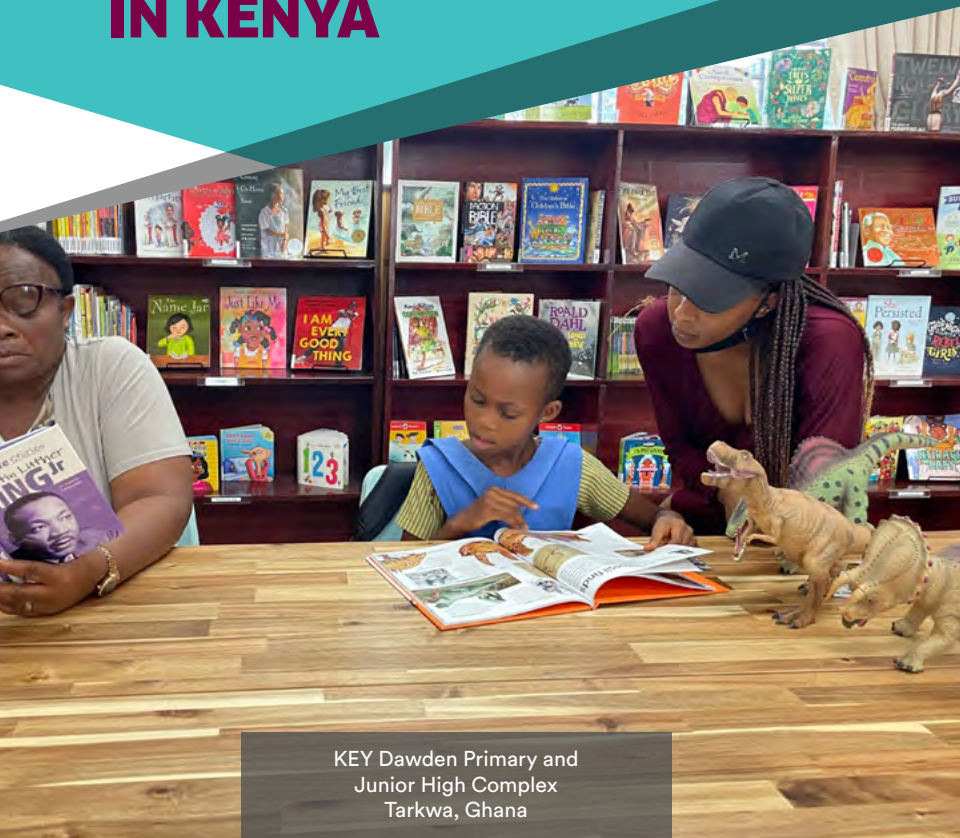
KEY Dawden Primary and Junior High Complex Tarkwa, Ghana