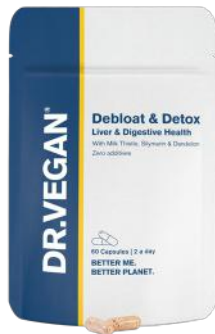
Debloat & Detox