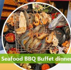
Seafood BBQ Buffet dinner