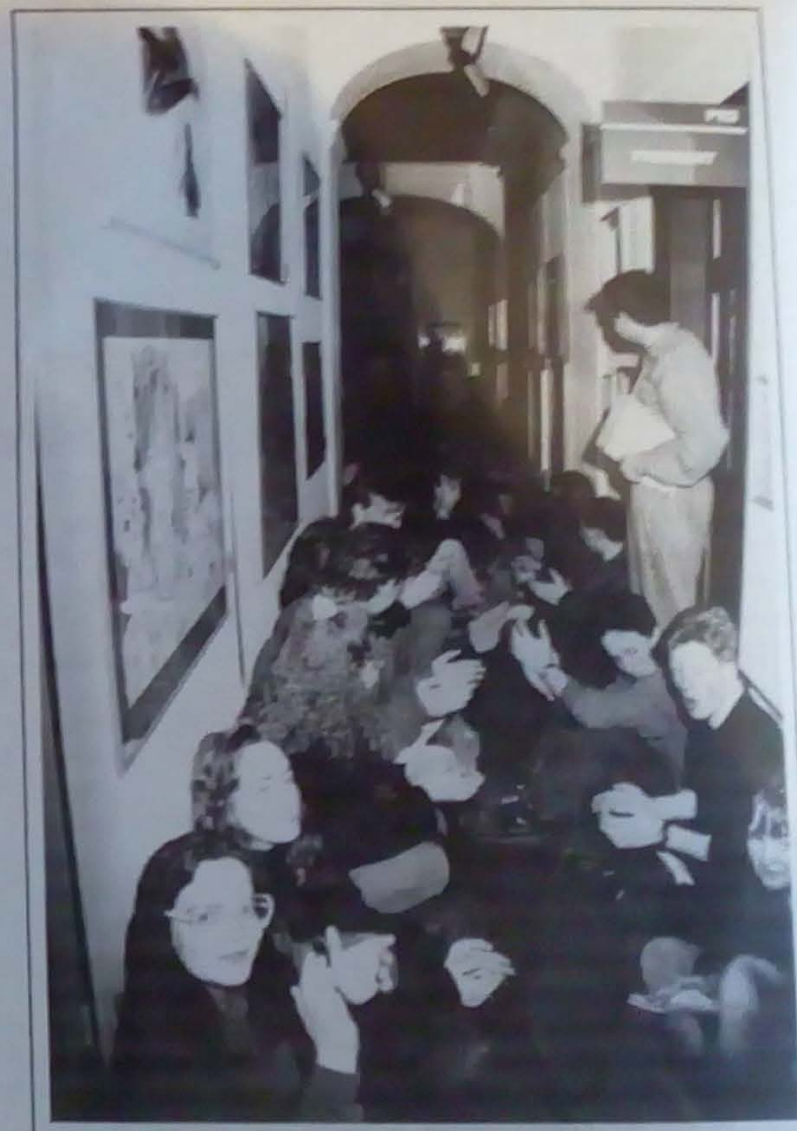
SU President addresses the protesters

were changed in late 1991 when a the Discipline Appeals Committee recommended that letters to students informing students that are being charged with an offence under under the code of conduct should also inform them of these rights.