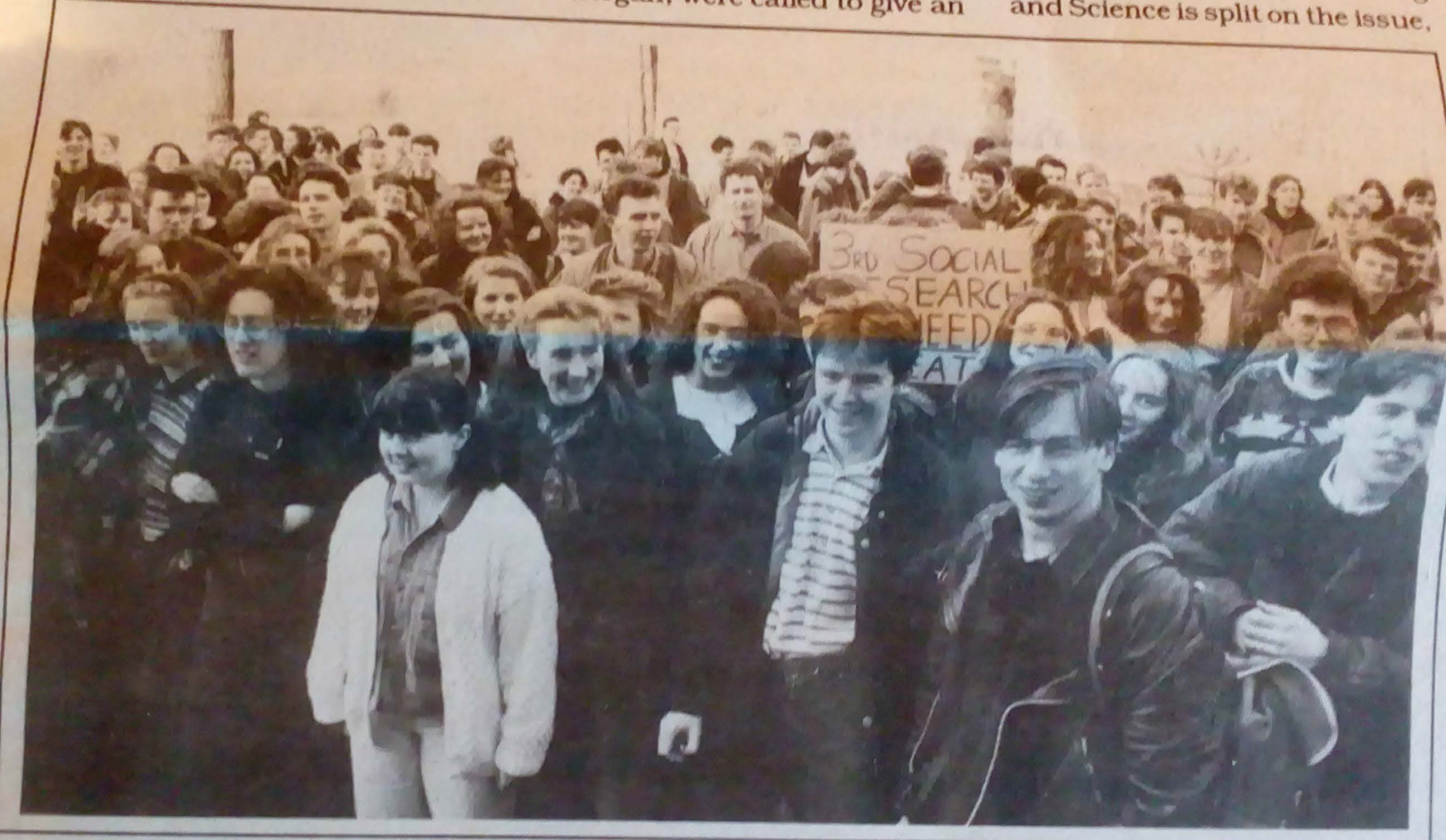
UL Students protest about repeats outside Plassey House

Connergan, were called to give an and Science is split on the issue,