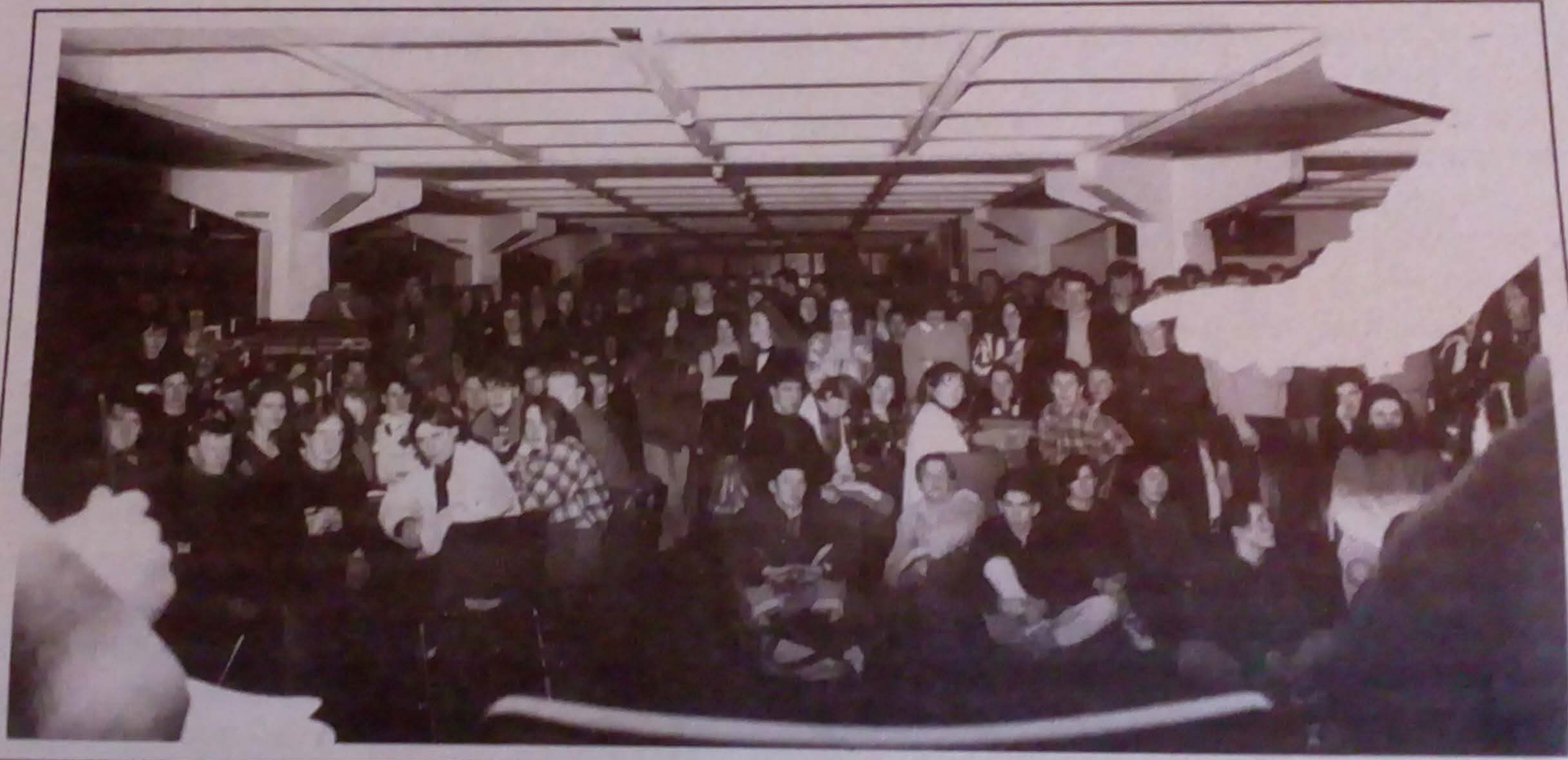
Union Meeting in Canteen prior to Whitehouse Occupation