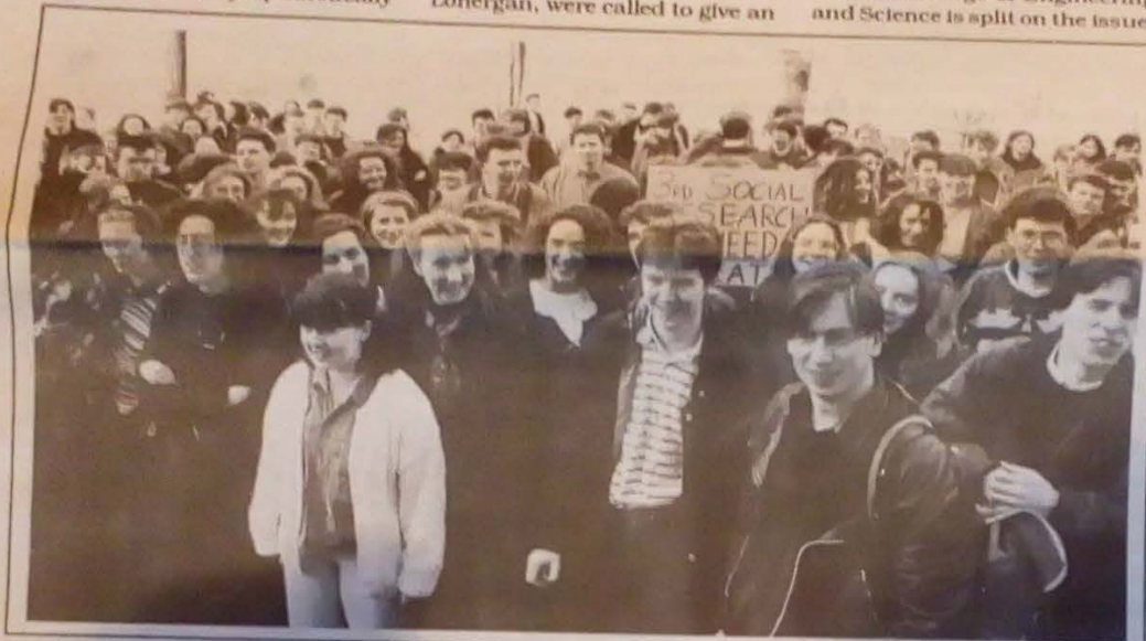
UL Students protest about repeats outside Plassey House