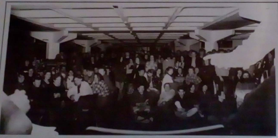
Union Meeting in Canteen prior to Whitehouse Occupation

The students applied to the Students' Union for legal representation for that hearing. In addition to presenting the facts of the case at the hearing last week, the legal representative also argued that the case should be dismissed for a series of legal reasons. Among these were the facts that before the first hearing the students weren't informed of their right to have legal representation or of their right to cross-examine witnesses. The University's discipline procedures were changed in late 1991 when a the Discipline Appeals Committee recommended that letters to students informing students that are being charged with an offence under the code of conduct should also inform them of these rights.