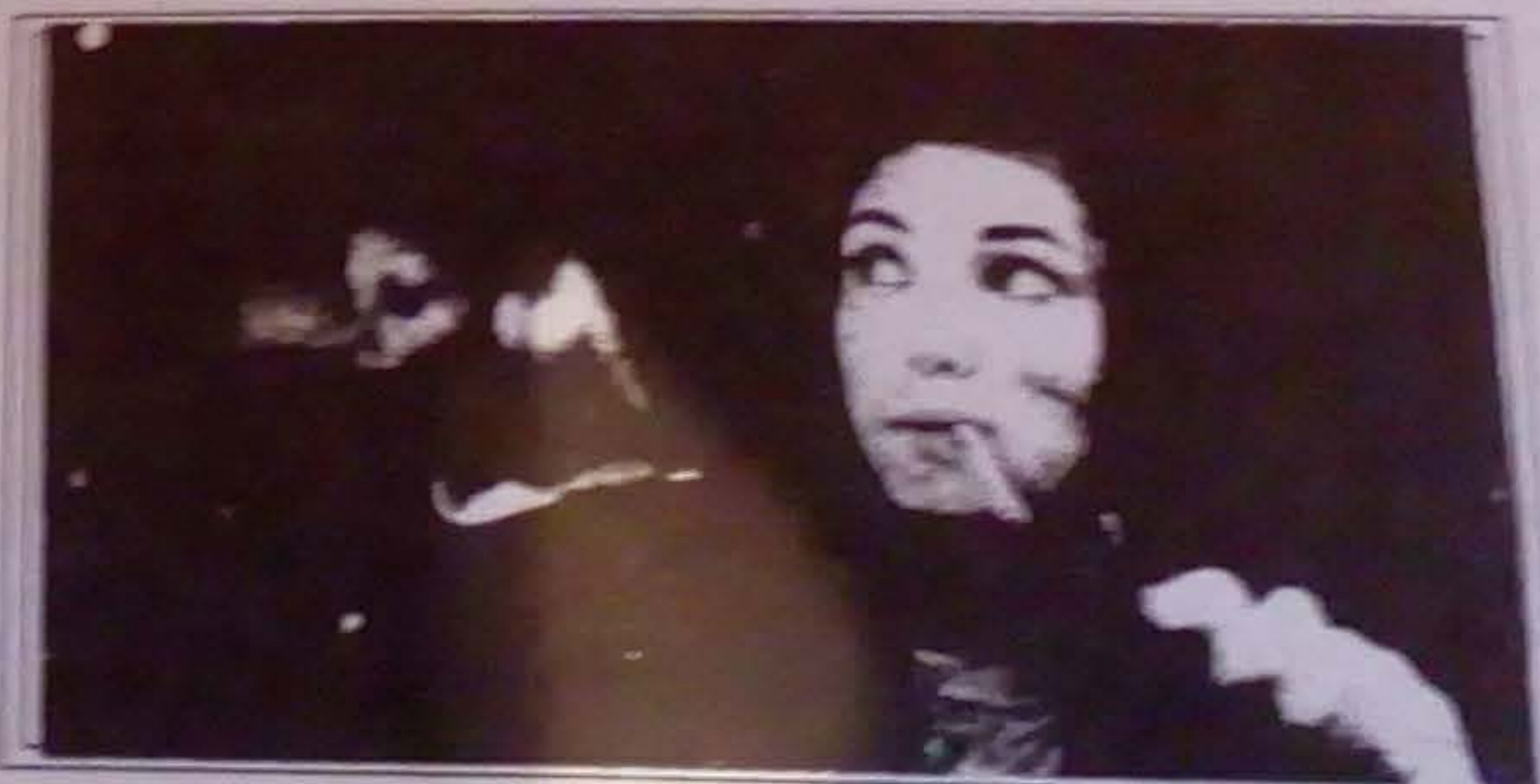
Winona Ryder in Jim Jarmusch's Night on Earth

The film has all the style and technical wizardry one would expect from a Greenaway film - it has been described as Renaissance MTV - and if it is, so what! Shakespeare will never be the same again!