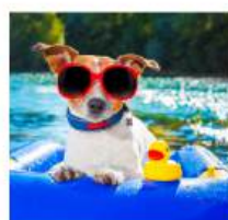
SONGS OF SUMMER