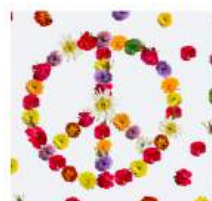
WOODSTOCK AND THE SUMMER OF LOVE