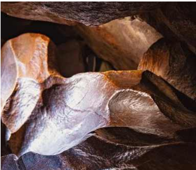
Inside a cave - Girraween National Park

Do you have photos from a visit to a national park or protected area? Send them to admin@npaq.org.au or connect with us on Instagram @nationalparksassocqld for your chance to feature in the next edition of NPAQ's PROTECTED Magazine! The best photos will also be featured on NPAQ social media channels and go in the draw to win some awesome NPAQ prizes*.