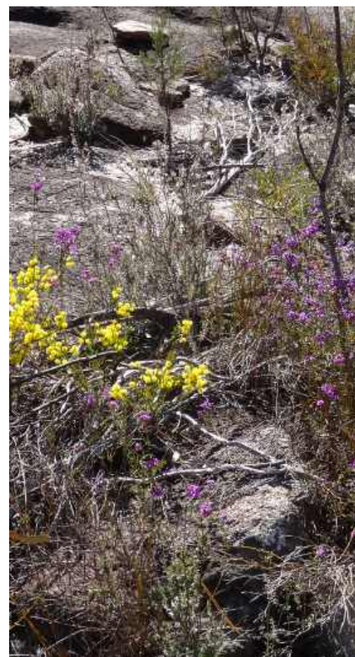
Photo Banner: Caves in Girraween National Park

My next trip will be in Spring to see spectacular yellow, purple and red pea flowers, golden billy buttons, blue bells, white heath bells and sarsaparilla splashed across the rugged granite landscape.