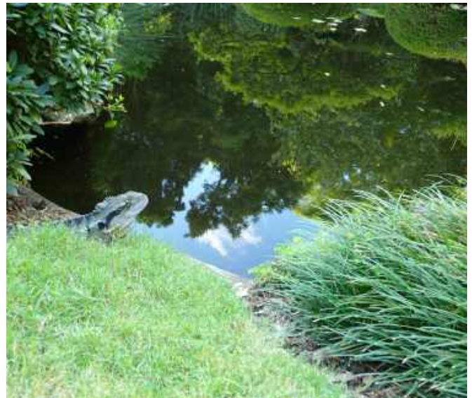
Water dragon at Mt Coot tha Botanical Gardens