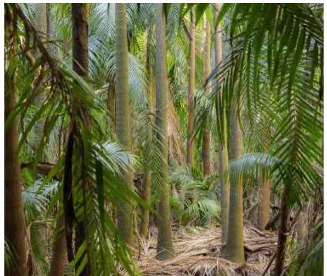
Palm Island National Park