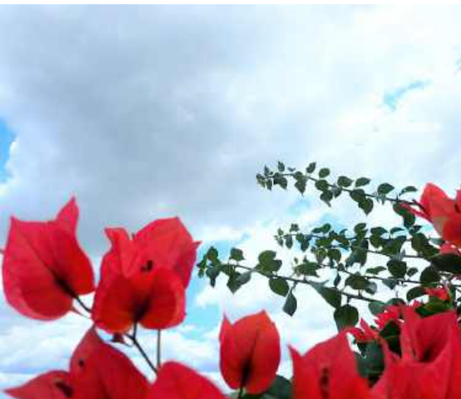
Bougainvillea