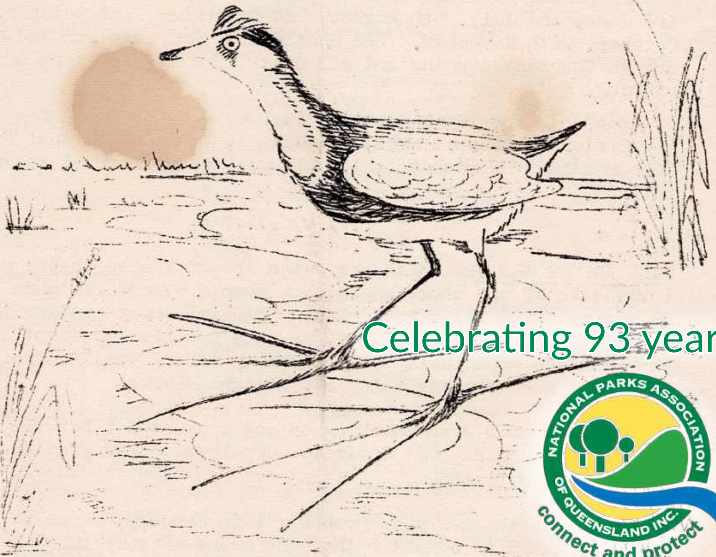
JACANA OR LOTUS BIRD ( Irediparra gallinacea )

A water pheasant found in Qld. & N.S.W. as far south as Sydney. Colouring :- Brown back and wings - black chest & back of neck - white throat & body. Orange margin on neck - scarlet comb. -