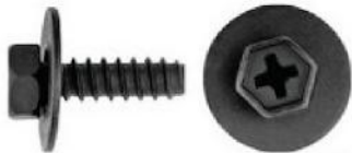
22294 (Mazda: 9CF600516B) Black Phosphate

M5-1.81 x 16mm Phillips Hex Head Sems® Washer Outer Diameter: 16mm Hex: 8mm