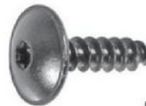
21541 (13144822) Black Zinc

M5.5 x 20mm (12 x 25/32") Torx® Truss Head T-20 Drive