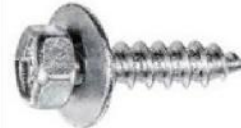
21839 (Toyota: 90159-A0001; 90159-50316) Zinc

M5.2-2.0 x 21mm (#12 x 13/16") Phillips Hex Head Sems® Washer Outer Diameter: 14mm (9/16") Hex: 10mm