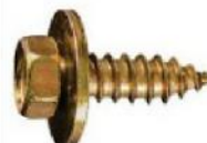
17461 Zinc & Yellow Dichromate

M5.5-1.81 x 18mm (#12 x 45/64") Hex Head Sems® Washer Outer Diameter: 15mm (19/32") Hex: 8mm Imports