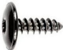
22111 (VW: N90892001, N90775001) Black Zinc

M5-2.12 x 19mm Torx® Truss Head Tapping Screw T25 Drive