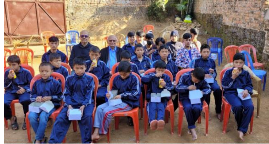
Picture with the Students of Aama ko Maya Chhatravas

With its objective of filling up the skill gap, 'Skill Development Centre Computer training' is confident to raise the standard of living of our country's youth by transforming them into skilled manpower.