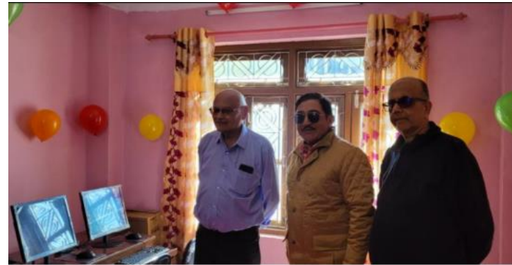
Observation of Center