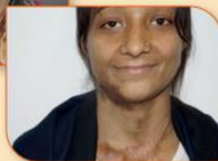
After surgery (right)

Medics4sewa encourages medical professionals to offer their services and skills in much needed advanced treatments and surgeries at DRI establishments.