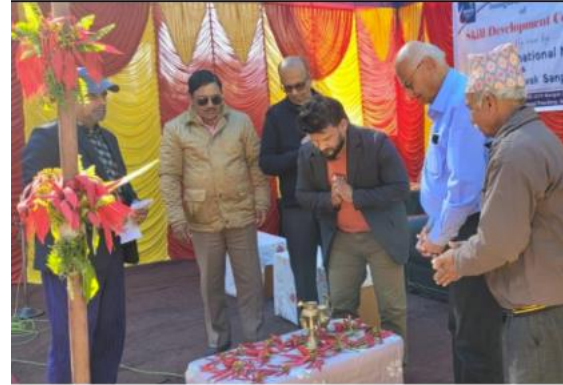
Opening of Ceremony by Lightening Deep

Around 60 community leaders and members participated in the opening ceremony.