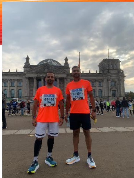
Berlin Full Marathon