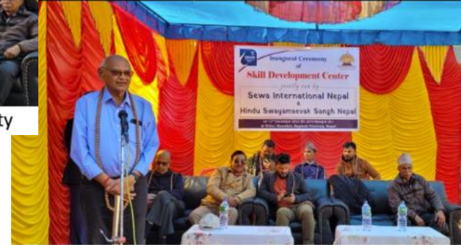
Remarks of Chairperson, Sewa UK

Digital literacy is a crucial aspect for human development and it significantly contributes to socio-economic progress. Nearly two-thirds of the population of the Nepal still resides in rural/tribal areas, but only few people are equipped with the skill of digital education where more than 70% people lacks the access to proper digital education, which is higher in hilly/mountainous areas.