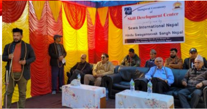
Remarks of Chief Guest, Mayor of Bidur Municipality