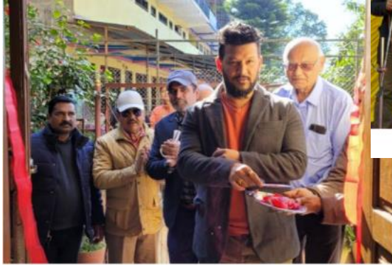
Inauguration of Skill Development Center