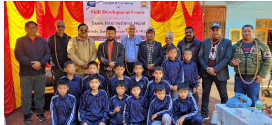
Group Picture at the End of Ceremony