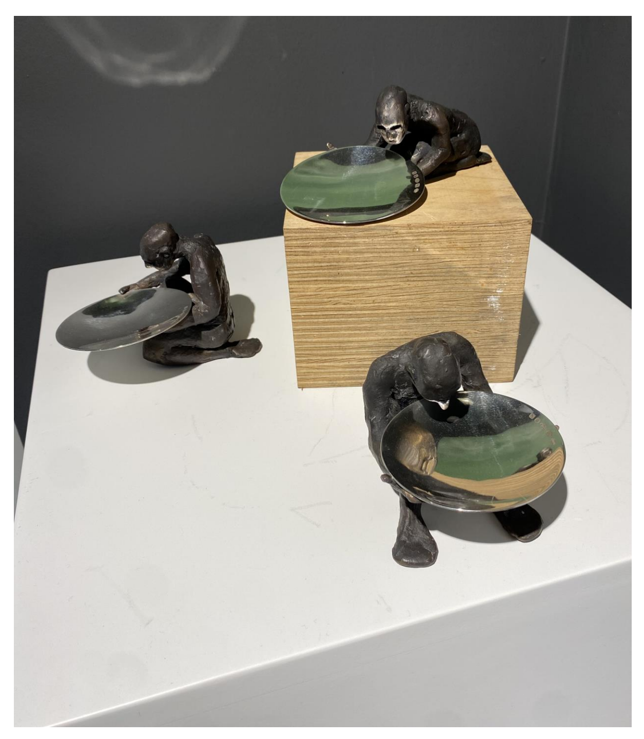
A selection of bronze and sterling silver sculptures by William Romeril