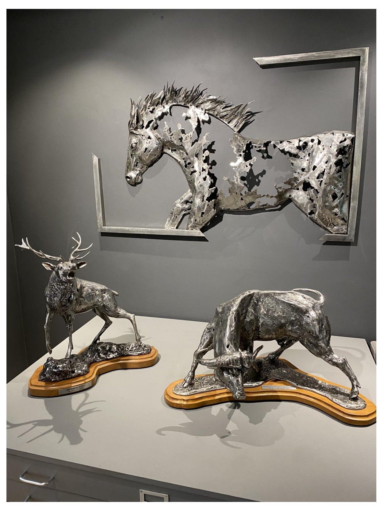
A selection of stainless steel works by Michal Gautron