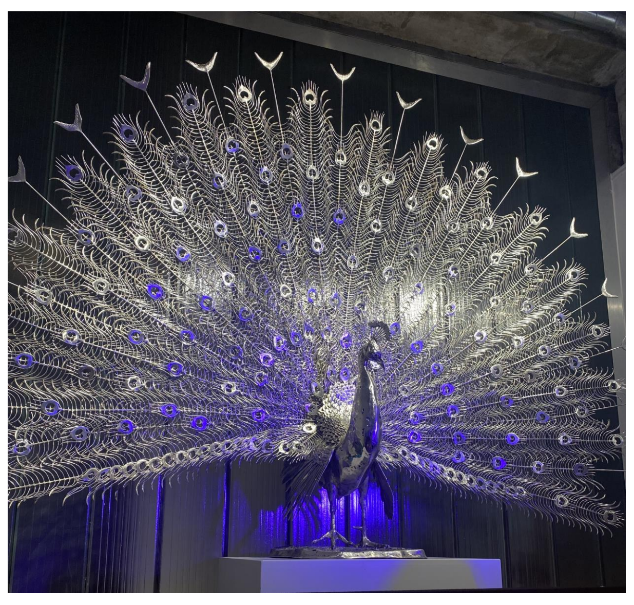
Michael Gautron, Peacock, 2022, Stainless Steel, 320cm x 180cm x 60cm