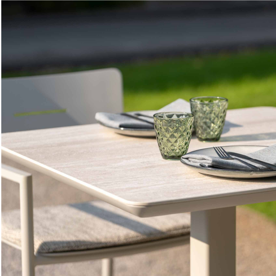
Lucca dining table, Lynsa dining chair