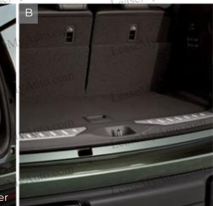
shown as barrier