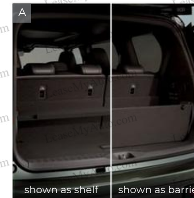
shown as shelf