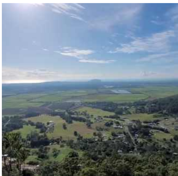
Mt Ninderry