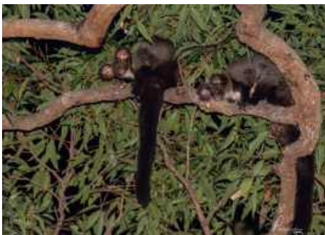
Photo Banner & Inline : Petaurides volans (Greater Glider)

Their low rates of reproduction and their limited dispersal ability inhibits population recovery. While they can glide for distances of 100 m, they rarely come to the ground, so gaps larger than 100 m are an insurmountable barrier to movement. Greater gliders are also notoriously fussy when it comes to using nest boxes, but rear entry designs and moulded plastic hollows that mimic the thermal properties of natural tree hollows offer hope for the future. Friends of Nerang National Park have recently installed a mixture of 50 of these two designs, hoping to secure and expand the population of gliders in this 1600 hectare urban protected area. Actions such as these may provide a glimmer of optimism for the survival of these beautiful marsupials in the face of urban sprawl, continued land clearing, and increased risk of severe bushfires or prolonged heat waves in a changing climate.