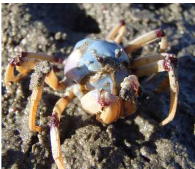
Mictyris longicarpus (Soldier Crab)

Do you have photos from a visit to a national park or protected area? Send them to admin@npaq.org.au or connect with us on Instagram @nationalparksassocqld for your chance to feature in the next edition of NPAQ's PROTECTED Magazine! The best photos will also be featured on NPAQ social media channels and go in the draw to win some awesome NPAQ prizes*.