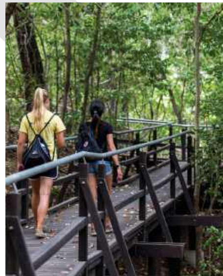
Photo Banner & Inline : Bowling Green Bay National Park

For more information on Bowling Green Bay National Park visit the Queensland Parks website: https://parks.des.qld.gov.au/ and if you'd like to stay at Townsville Eco resort please visit https://townsvilleecoresort.com.au/