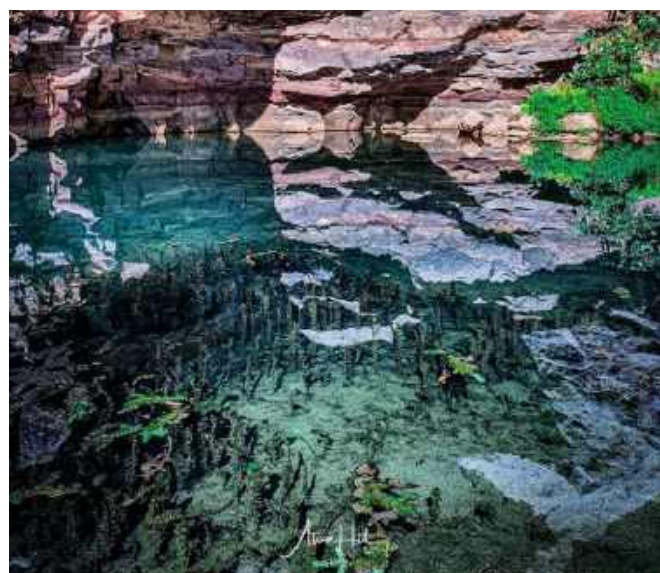
Carnavon Gorge National Park Ally Hill (@ally_hill_hikes - Instagram)