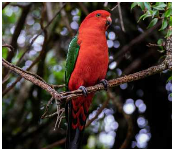
Alisterus scapularis (Australian King Parrot)