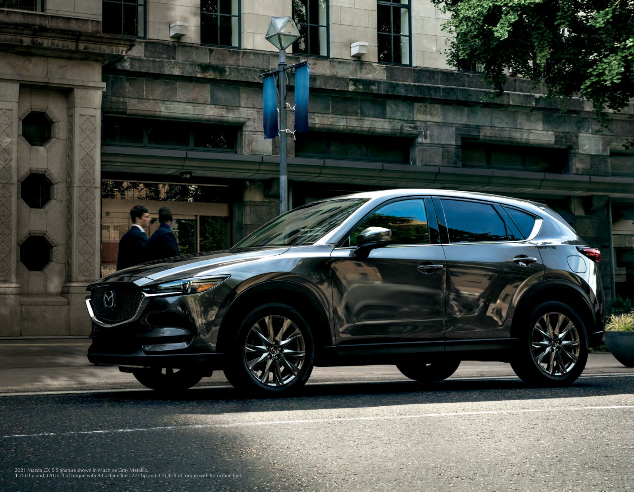
2021 Mazda CX-5 Signature shown in Machine Gray Metallic. 1 250 hp and 320 lb-ft of torque with 93 octane fuel. 227 hp and 310 lb-ft of torque with 87 octane fuel.