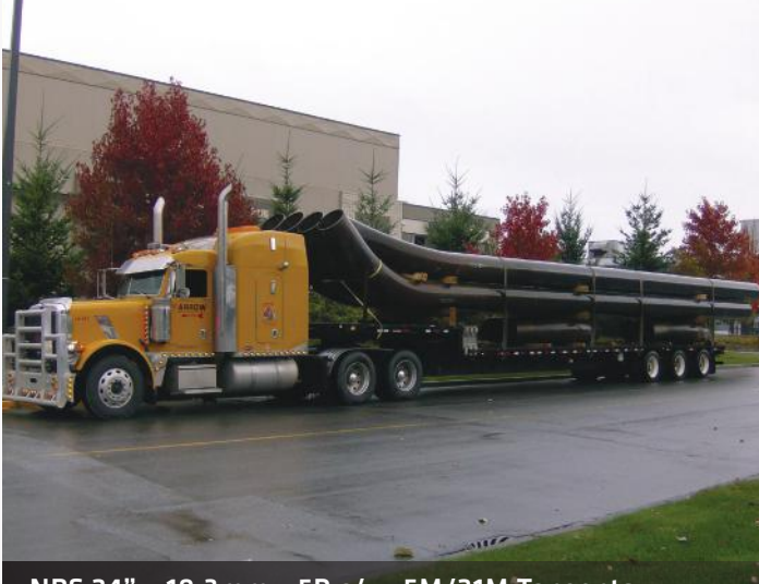
NPS 24" x 10.3mm x 5D c/w .5M/21M Tangents