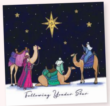
Follow the Star Greeting: Happy Christmas 125mm x 125mm, Gloss CRH47 Cat No.11