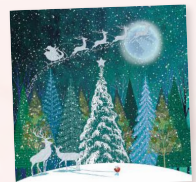
Flying over the Forest

Greeting: Best Wishes for Christmas and the New Year 150mm x 150mm CRH56 Cat No.20