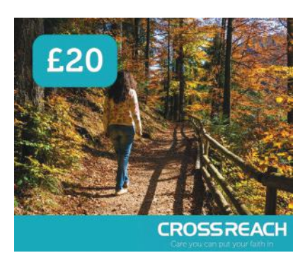
£20 could pay for an outing to allow someone in recovery an escape for the day (AC20)