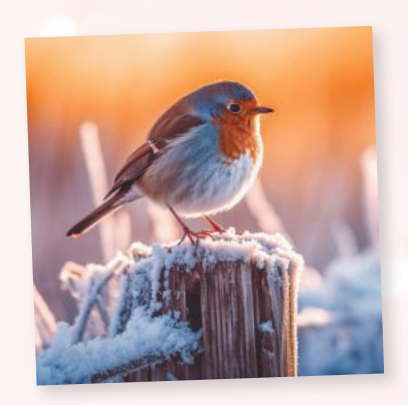
Winter Robin Greeting: Wishing you a wonderful Christmas and a very happy New Year