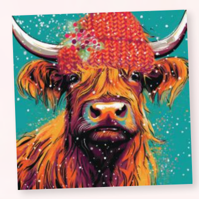
Wrapped up Warm

Greeting: Merry Christmas 125mm x 125mm, Gloss CRH59 Cat No.23