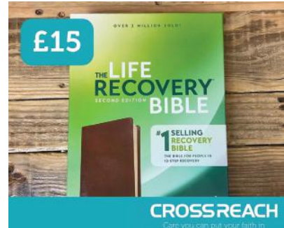
£15 could buy a life recovery bible for people working through addiction. (AC15)