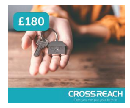
E180 could pay for support to someone taking on their first tenancy following residential rehabilitation. Giving them a good transition and the best chance of sustained recovery (AC180)