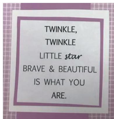
NICU nurses provide Memory Scrapbooks for patients and their families