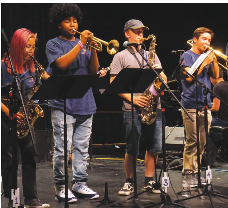
A student combo performs at the Lafayette Summer Music Workshop final concert