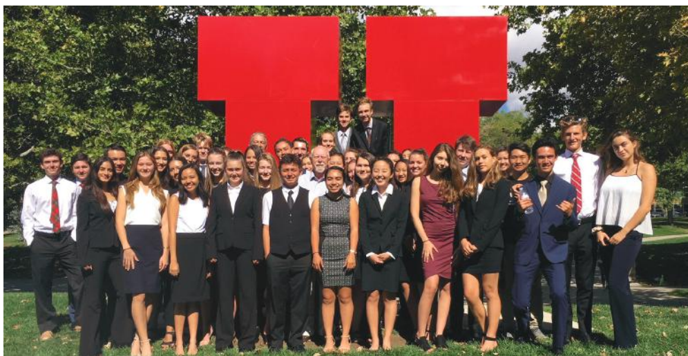
Parker School debate students at the University of Utah