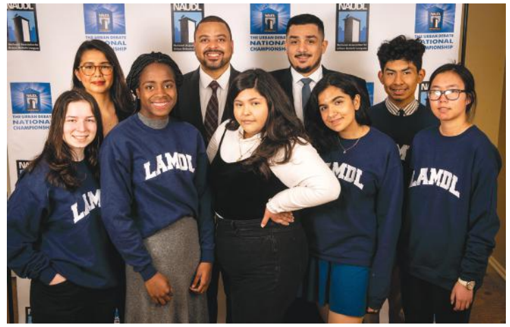
LAMDL students at the Urban Debate National Championship at Georgetown University

In the past, LAMDL students have been limited to local league tournaments, because attending national invitational tournaments has been cost-prohibitive for them. However, with support from The Julia Burke Foundation, LAMDL was able to fund a travel team last year, with members competing on the invitational circuit. The formation of the travel team allowed high-performing debaters from L.A. public schools to gain access to highly competitive national policy debate tournaments, and to compete against debaters from private and public schools all over the United States. These debates, in turn, improved the rigor of our local league tournaments through the new strategies, arguments, and skills brought back by our students from national competition. This year's