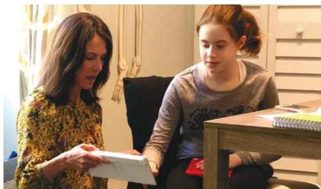
Hirsch Academy students have new access to STEM subjects & improved technology