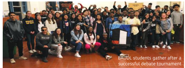
BAUDL students gather after a successful debate tournament

With generous support from The Julia Burke Foundation, BAUDL hosted eight debate competitions during the past year that 279 different students participated in, representing 20 different high schools and middle school programs in Oakland, San Francisco, Richmond, and Emeryville. We facilitated travel to competitions at regional colleges and universities, and BAUDL students also participated in the National Urban Debate League national championships in Washington DC. We also organized and implemented an intensive weeklong summer debate workshop for 91 students with professional development for nine teacher-coaches. In addition, we covered the cost for