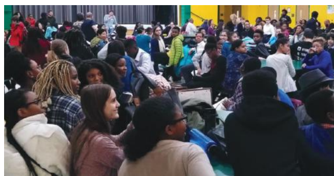
More than 200 students filled the cafeteria at the Julia Burke Invitational in Fall 2019