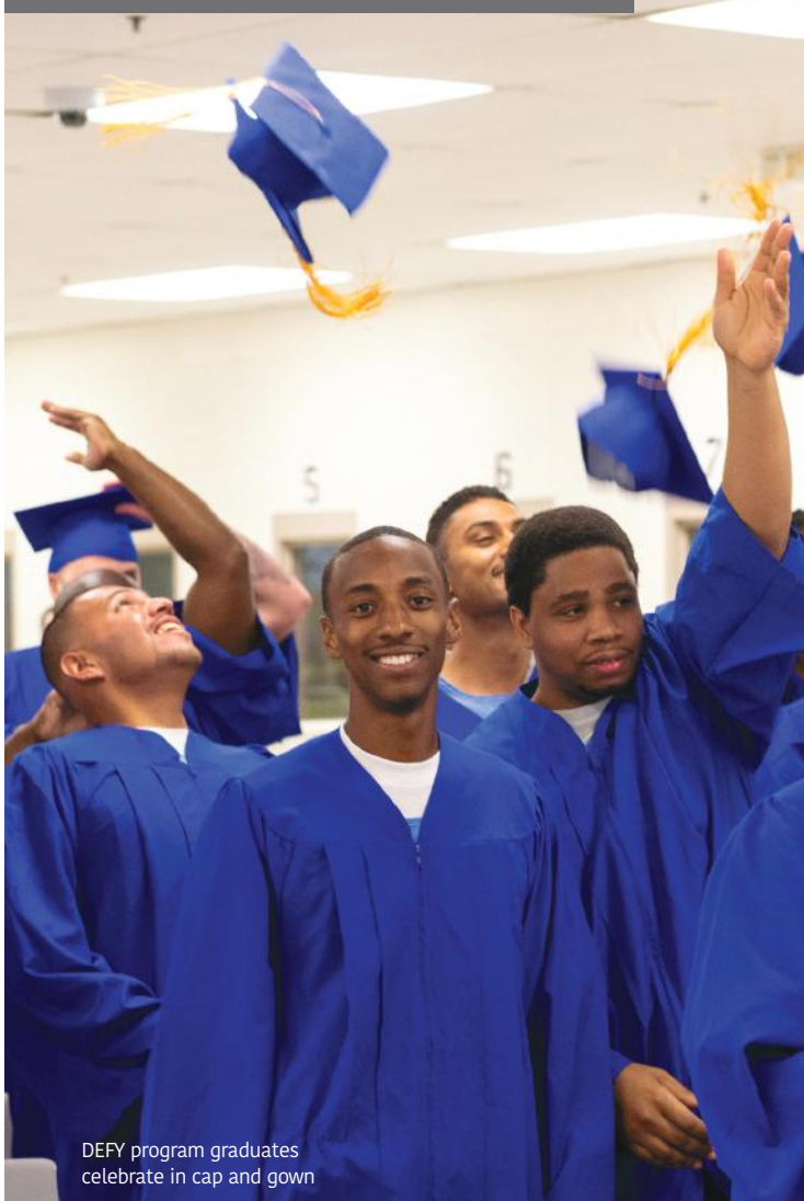
DEFY program graduates celebrate in cap and gown