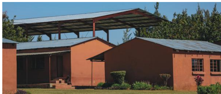
The Terranova School in Mazabuka, Zambia

The Terranova School, in Mazabuka, along with The Julia Burke Medical Clinic, continues to offer life-changing services to this community. Not only are the children receiving a fantastic education—many graduates are receiving scholarships to the local universities. They also have some of the best medical care in the province. If you live in one of the 11 surrounding villages, instead of walking half a day to a clinic, you now can walk half a mile or less to see a