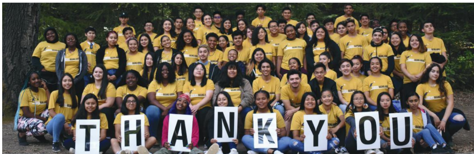
Students at the 2019 New Student Retreat in August at the YMCA Camp Jones Gulch in La Honda