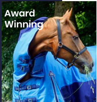
£159.00 RRP £79.95 Price