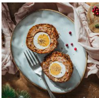
13. SCOTCH EGGS