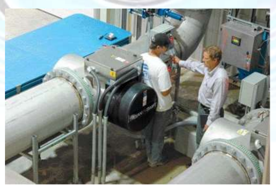
Arrow Creek Ultra Violet Disinfection Equipment

Although the water system was first developed in 1929, unsafe water quality issues due to the inadequate treatment processes resulted in a new water treatment plant being commissioned on Arrow Creek in 2005. The $9.3 million treatment process includes coarse screening, settling, fine screening, membrane filtration, UV disinfection and residual disinfection by chlorination.