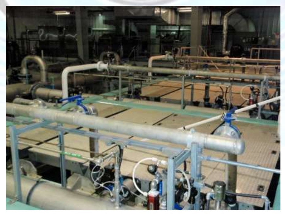
Arrow Creek Water Treatment Plant

especially during orchard watering operations. However, water conservation measures taken by the Town and Columbia Brewery, combined with water system optimization practices to streamline the peak water requirements from Arrow Creek, have effectively eliminated the requirement for the operation of the Creston groundwater source wells. Both wells are maintained and run weekly to ensure that the Town of Creston has a sustainable water supply in the event of any emergency contingency.