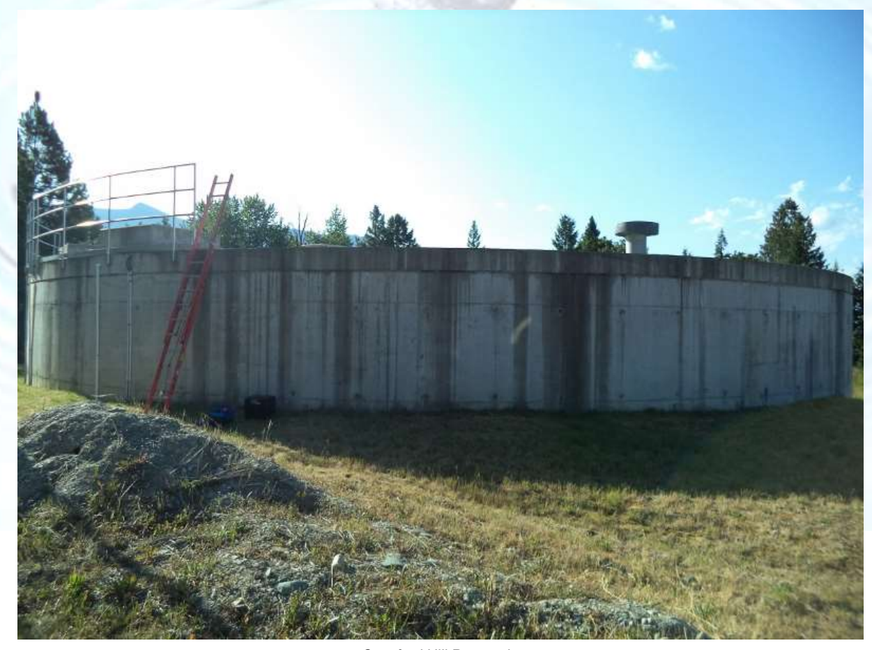
Crawford Hill Reservoir

63 kilometers of water main interconnect the Town reservoirs to the community. 2844 residential connections and 236 commercial/industrial connections ensure that the Town population of 5351 (2016 Census) have unrestricted access to the Town water supply.