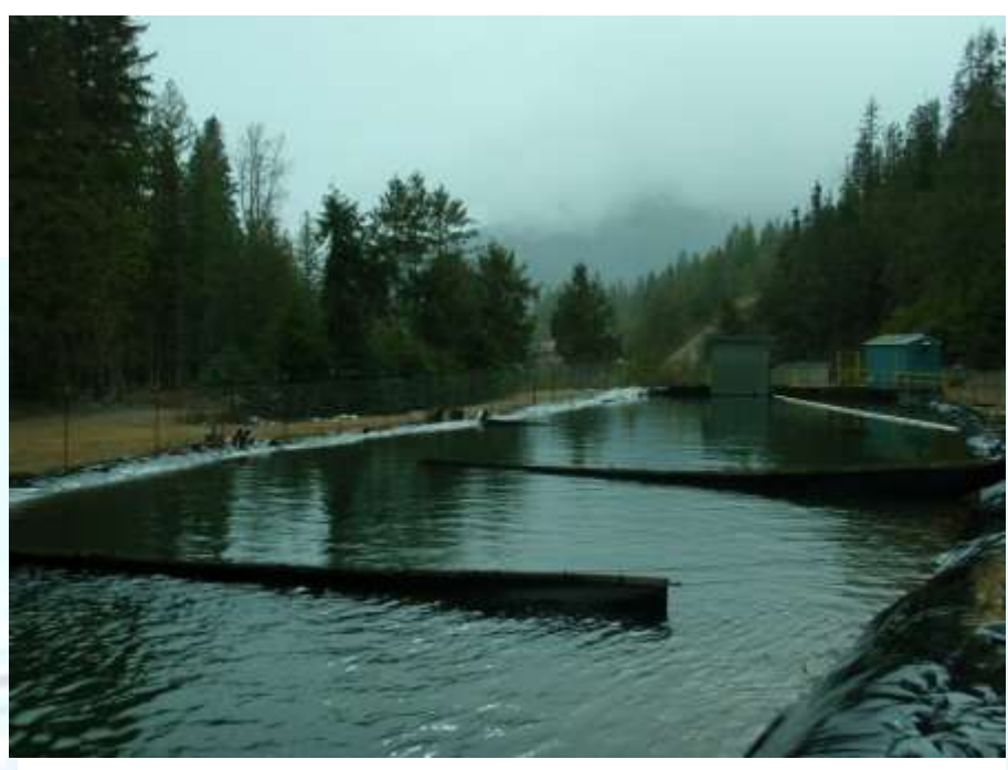
Arrow Creek Raw Water Supply

Additionally, the Town of Creston maintains two potable groundwater wells within the confines of Creston itself that are independently capable of providing an adequate potable water supply for the community. These wells were initially designed as a supplementary water supply during summer months when water production is at its peak, most