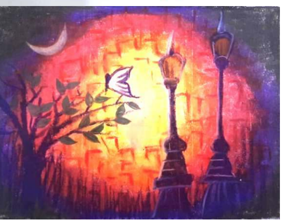
A.V. Lakshmi Sravani 1/4 AI&DS