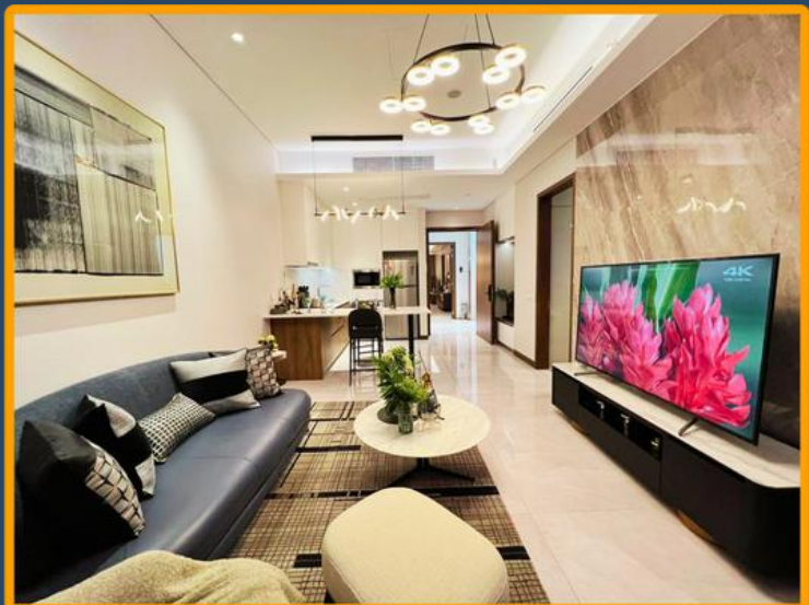
A Pinnacle of Urban Living in the Heart of Kuala Lumpur.

Distinguished by its well-planned modern layouts and double green certification with GBI Gold & LEED rating, Core Residence @ TRX development's 580 units, spread across 50 floors, embody a harmonious blend of contemporary architectural aesthetics and exceptional livability. Residents can indulge in a world of exceptional amenities, including an infinity swimming pool, wading pool, jacuzzi, sunken sanctuary with BBQ lounge, and a rooftop gymnasium.