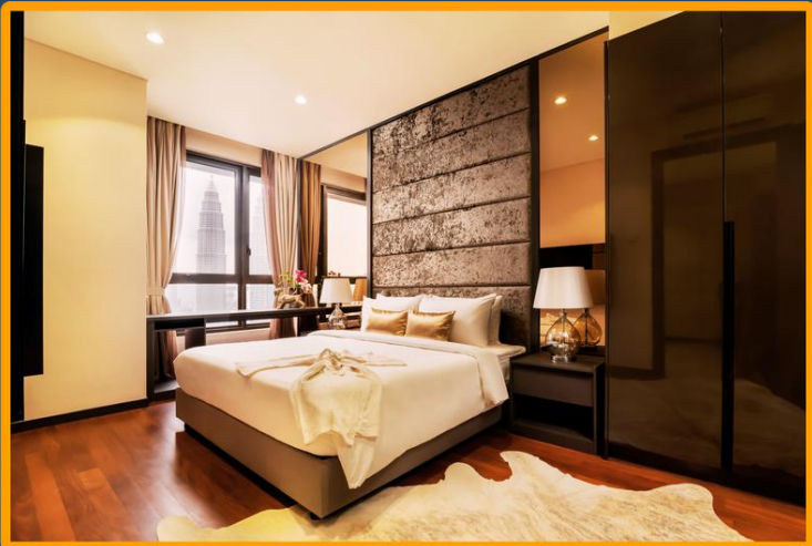
Where Luxury and Tranquility Converge

Nestled within the dynamic heartbeat of Kuala Lumpur's bustling cityscape, Wyndham Suites KLCC emerges as an exclusive haven, seamlessly weaving luxury and serenity into its fabric. Positioned atop a hill, this sophisticated property serves as a tranquil escape from the daily chaos, inviting individuals, couples, or families of four to immerse themselves in the refined elegance of its meticulously designed interiors.