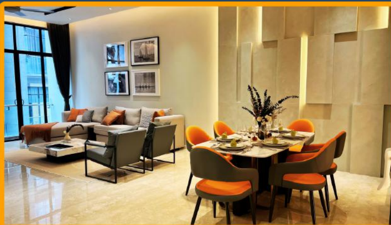
Zen-Inspired Luxury Amidst the City's Dynamic Rhythm

18 Madge Onsen Suite stands as a luxurious haven, providing a serene escape within the lively city of Kuala Lumpur. Infused with Zen principles, this development seamlessly integrates contemporary design and natural elements, cultivating a tranquil atmosphere that promotes peace and inner harmony. Drawing from the pristine depths of Bemban, Malacca, the development boasts a natural hot spring facility, allowing residents to immerse themselves in mineral-rich waters renowned for their therapeutic properties, providing a gentle warmth to soothe both body and mind.