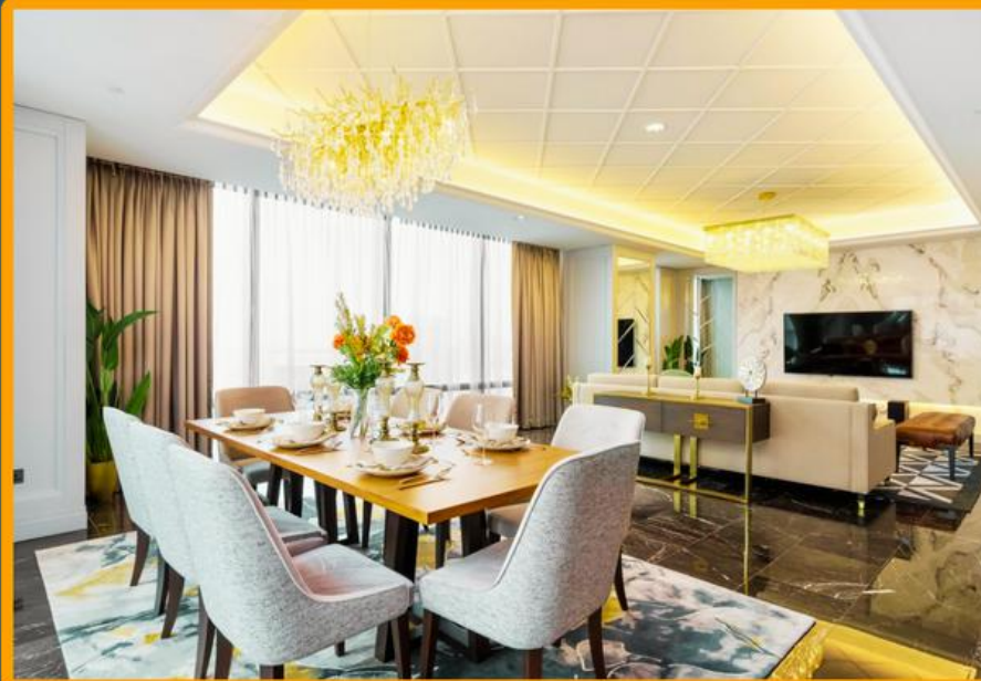
A Fusion of High-Class Living and Sensuous Lifestyle

The Residences at St. Regis Kuala Lumpur are more than just a place to live; they are a carefully curated experience that embodies opulence and sophistication. Picture yourself stepping into a world where every detail is a testament to refined living. From the moment you arrive, you are not just a resident; you are known by name, greeted with a personalized touch, and welcomed into an exclusive realm.