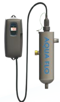
Aqua Flo Gen4 UV