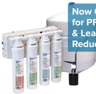
Aqua Flo Platinum QCRO4V-50

The HTO combines high efficiency softening with whole home carbon filtration. Add the Aqua Flo QCRO and Gen 4 UV to complete the Total Home Protection System .