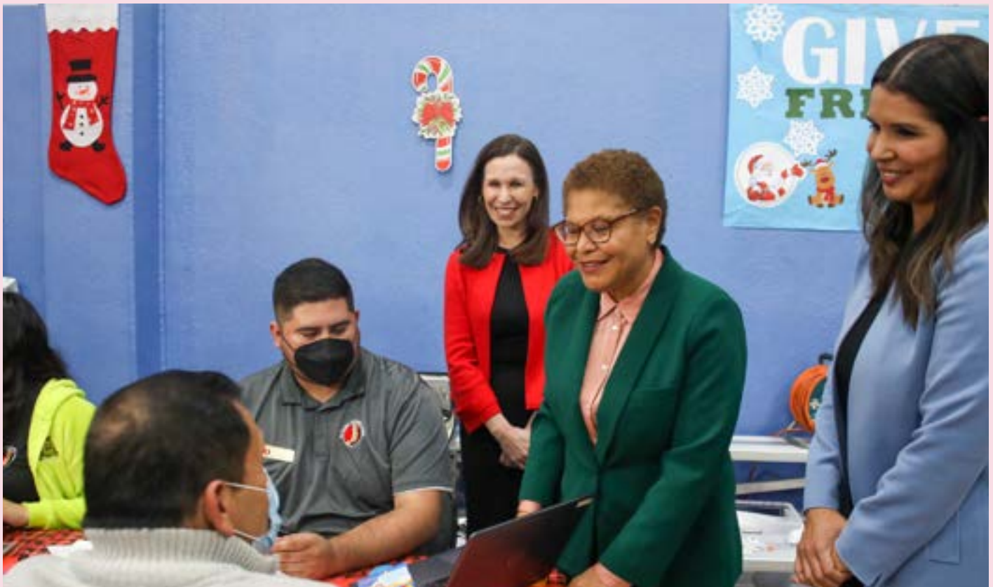
Mayor Karen Bass with staff and clients at the All Peoples Community Center launching the GIVEN direct cash assistance program to families in need.

Mayor Bass allocated additional funds in this year's budget to expand Family Source Centers, LA's Best after-school programs, and made new investments in child care facilities. Expanded services focused on the highest need in South Los Angeles, Panorama City, North Hollywood, Koreatown, and Central City.