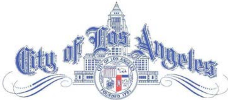
KAREN BASS MAYOR