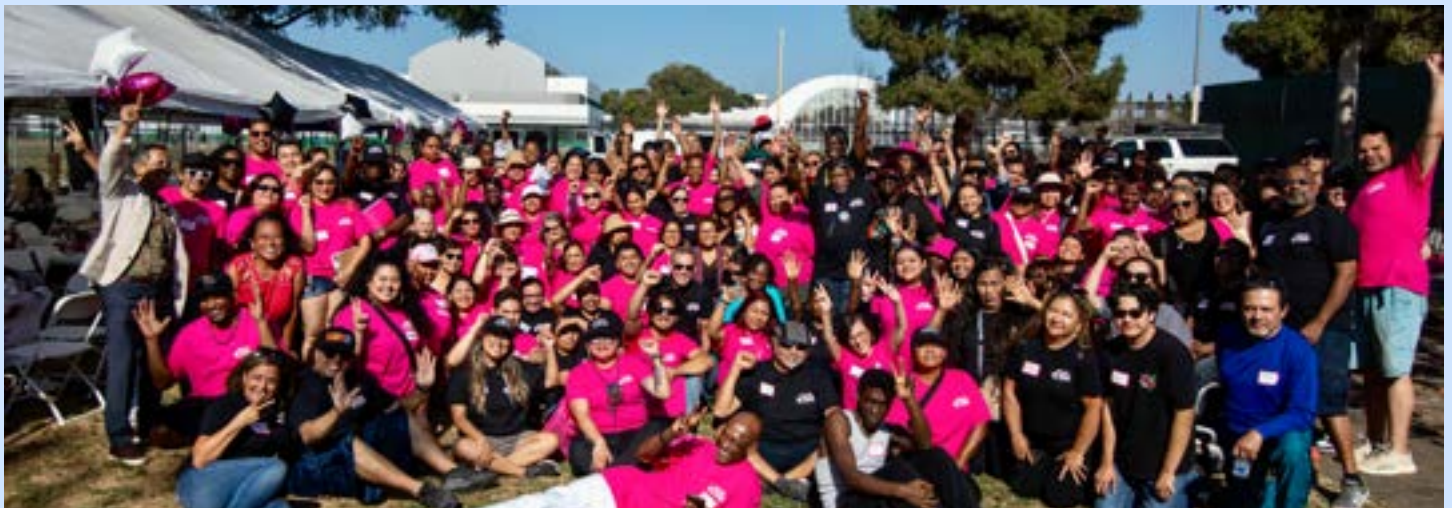
Mayor Karen Bass with We Are LA outreach workers. We Are LA reaches out to vulnerable Angelenos to directly connect them to a full range of homelessness prevention services.

The Mayor's Fund Los Angeles is a separate nonprofit organization dedicated to serving LA. In partnership with Mayor Bass, it has anchored its work with a major initiative to prevent Angelenos from falling into homelessness.