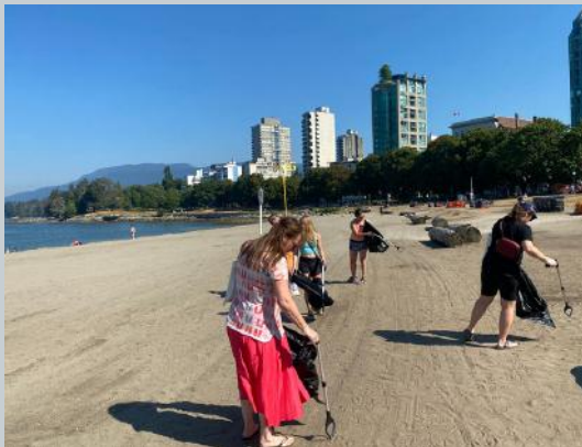
Esquimalt Lagoon clean-up, Victoria BC September 19 - 4:30 p.m.

Come join some of the Coastal Water Protectors for an information session and beach clean up. Receive a tote bag and gift card for participation. Register with Angel at a.fisher@bcmetis.com