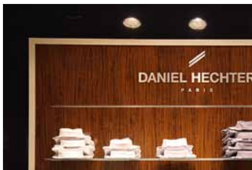
Gloss Prospects: Hansen menswear in Cologne

Glossy times are awaiting you: With our DecoBoard HG the highest quality is achieved by production with proven re-cooling technology. Pfleiderer offers a variety of core materials for various requirements, from P2 and low emission MDF, through to highly flame-retardant or lightweight options. In our DST-System High Gloss can be combined with 180 decors.