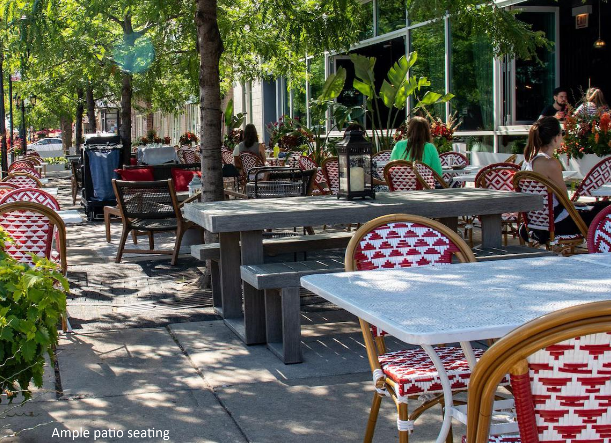
Ample patio seating