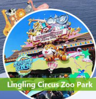
Lingling Circus Zoo Park