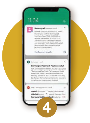
Get Confirmation Notification for The Pre-Authorized Reserve