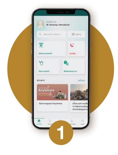
Open or Download the Bumrungrad App