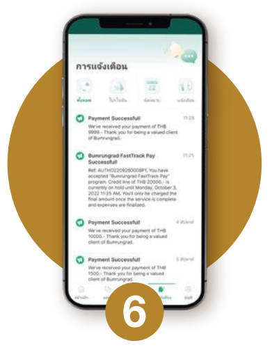
Get Your Medicine & Go Home Just Present Your Pre-Authorized Reserve Confirmation