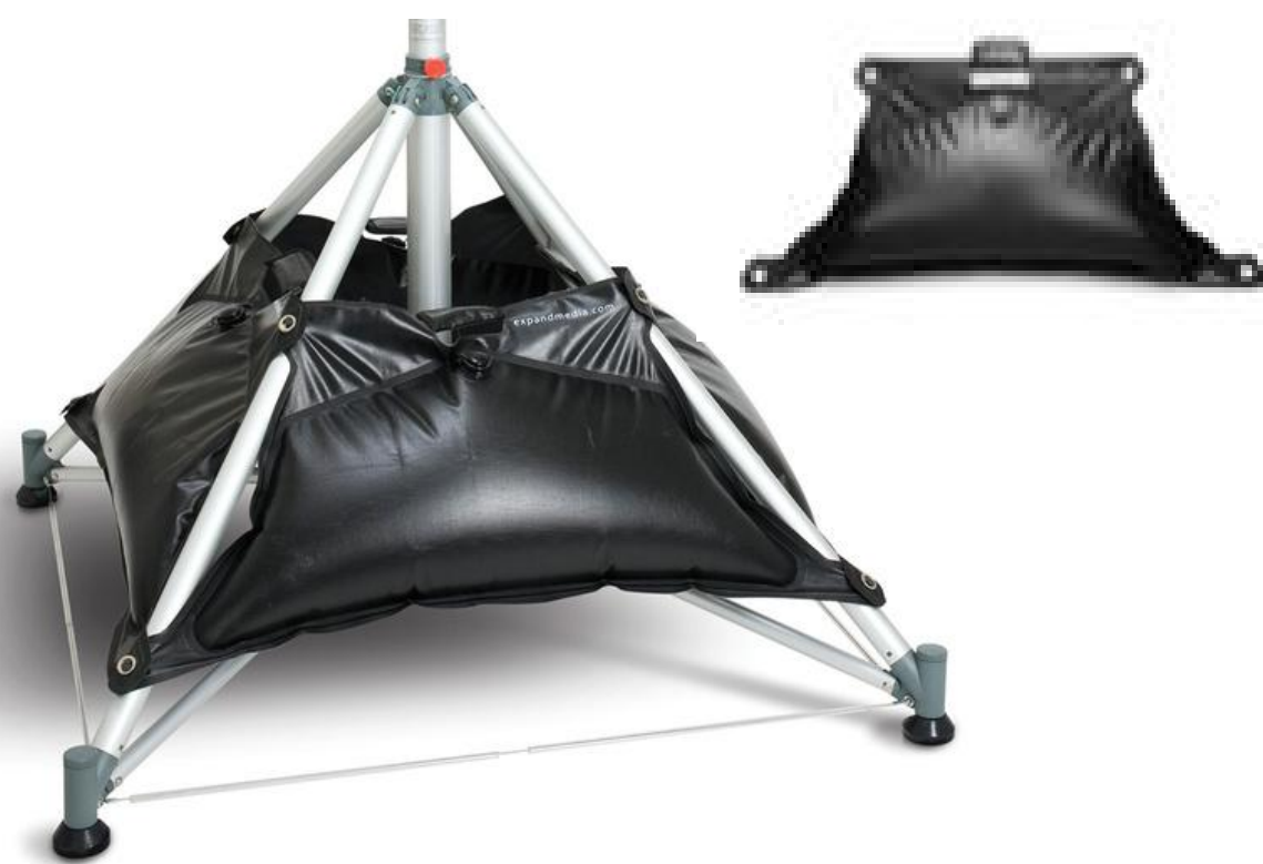
Water Bags Weights