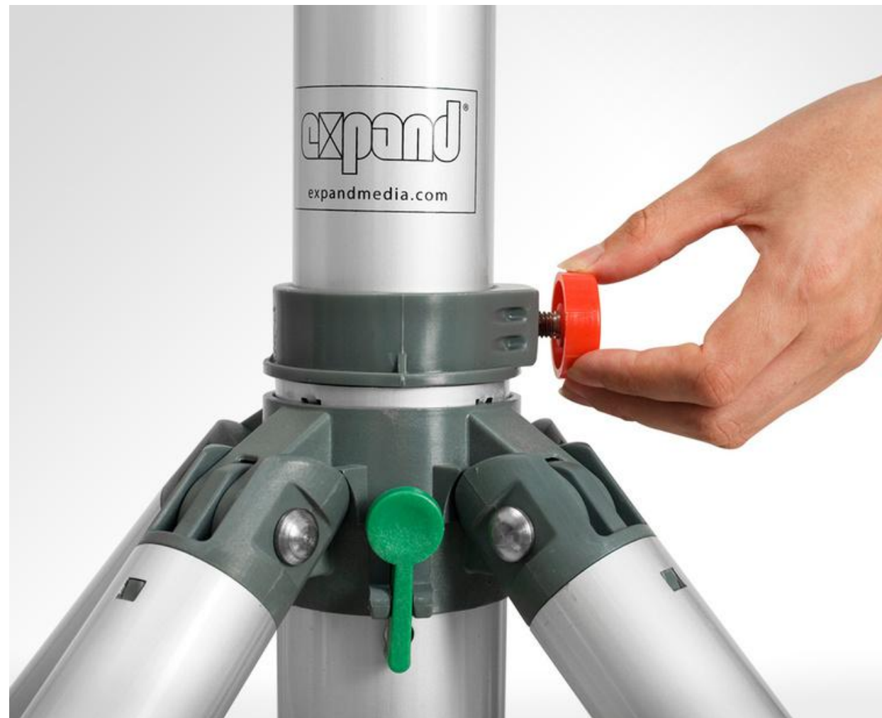
Lock desirable height up to 18'