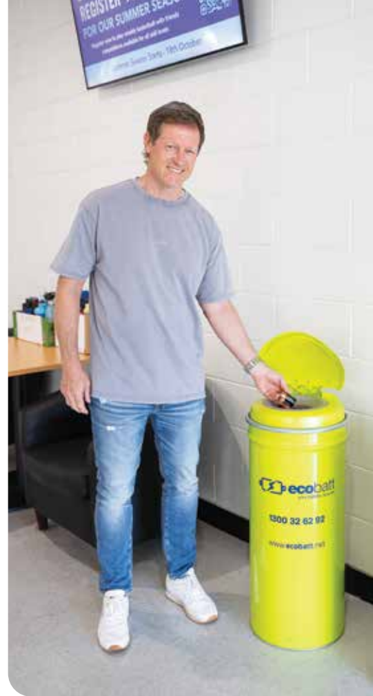
The new battery bin at Turramurra Recreation Centre.