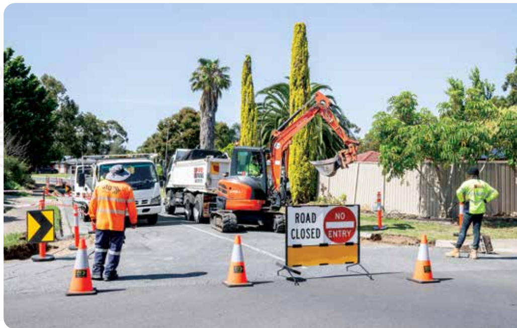
The Council is investing more than $8 million into road and footpath upgrades up to 30 June 2026.

The projects include roadworks starting at Surrey Farm Drive this month, at Tasman Avenue and