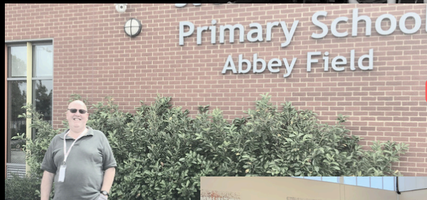
St. John's Green School 2018-'22