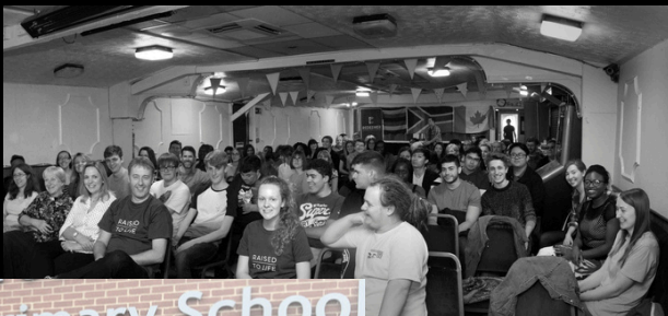
Belle-Vue Social Club 2016-'18