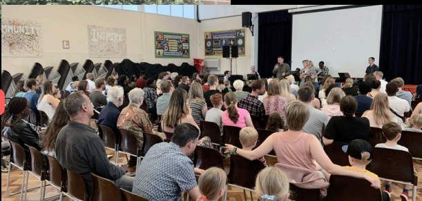
St. Benedict's College 2022 - '??