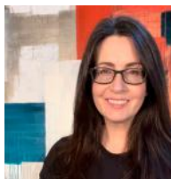
Debby Dines Painting + Photography urbanlifecollective.com