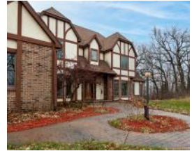
5343 Oak Park Medina $825,000 - SOLD