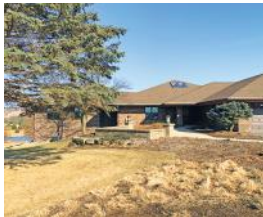
7930 Coray Springdale $1,900,000 - SOLD - BUY SIDE