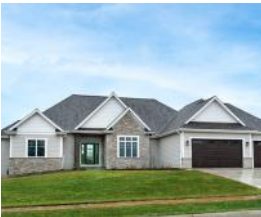
5653 Shenandoah Westport $1,035,000 - SOLD - BUY SIDE