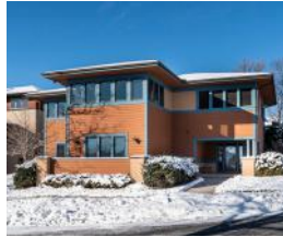
3324 Prairie Glade Middleton Hills PENDING