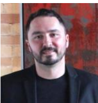
Martín Gutierrez Painting + Fine Furniture martingutierrez.art