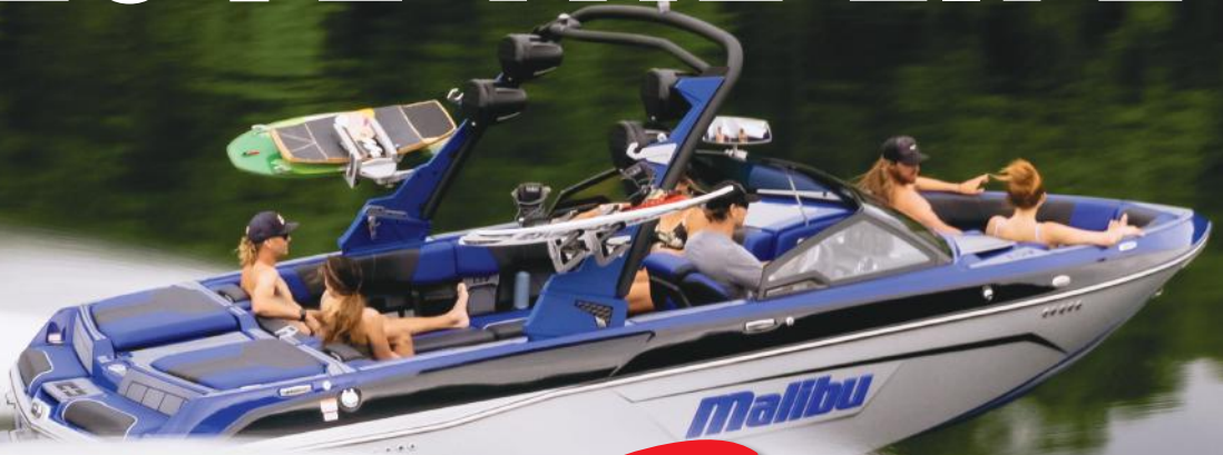
2022 MALIBU 23 LSV