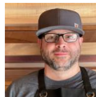
Jim Damewood Fine Furniture