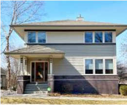
3324 Glacier Ridge Middleton Hills $775,000 - COMING SOON

WHEN IT'S TIME TO MOVE, SIT BACK. WE'VE GOT THIS.