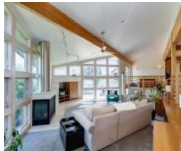
3900 Meridian Verona $825,000 - SOLD