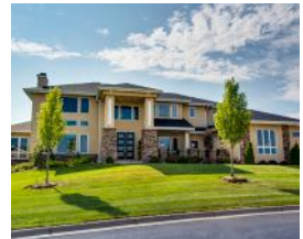
4817 St Annes Middleton $1,775,000 - SOLD