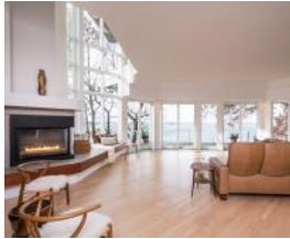
3506 Lake Mendota Shorewood Hills PENDING - BUY SIDE