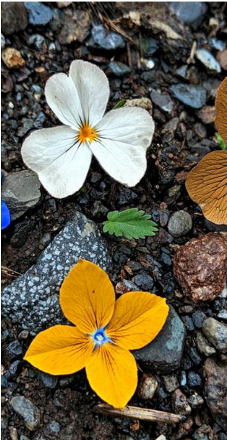
Sneak peek at April's Issue pg. 18

This month's Limited Edition kit is badass! pg. 9