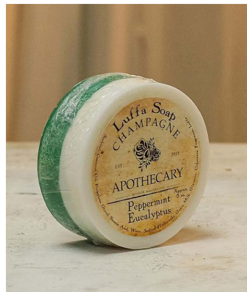
Take time to remember your blessings while you wash the day away with our Peppermint Eucalyptus Goat's Milk Luffa Soap

My mental health is the strongest it's ever been. I'm learning to love myself in ways I never thought would ever be possible. I stopped seeing myself as a failure and I've started recognizing ways I can evolve and empower myself. That didn't happen overnight though. It happened because one day, I decided that I wasn't going to wait for luck to find me...I was going to create it for myself because no one else was going to do it for me. It started the moment I made the decision to change my perspective...not just on myself, but on life itself.