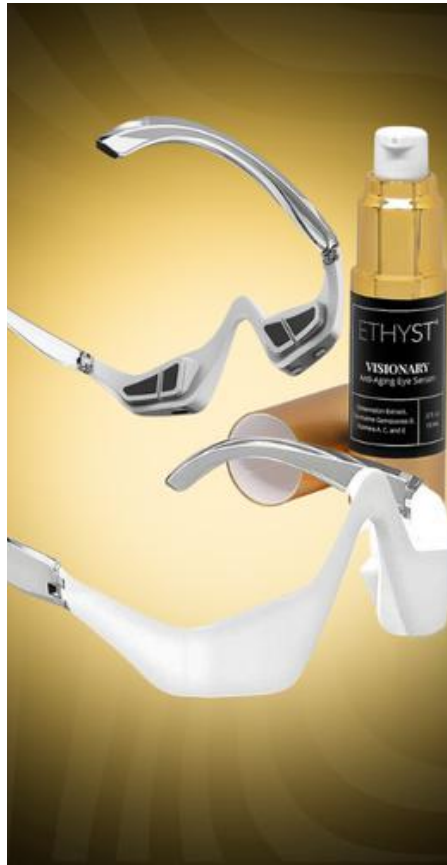
Learn about LED and Microcurrent pg. 20