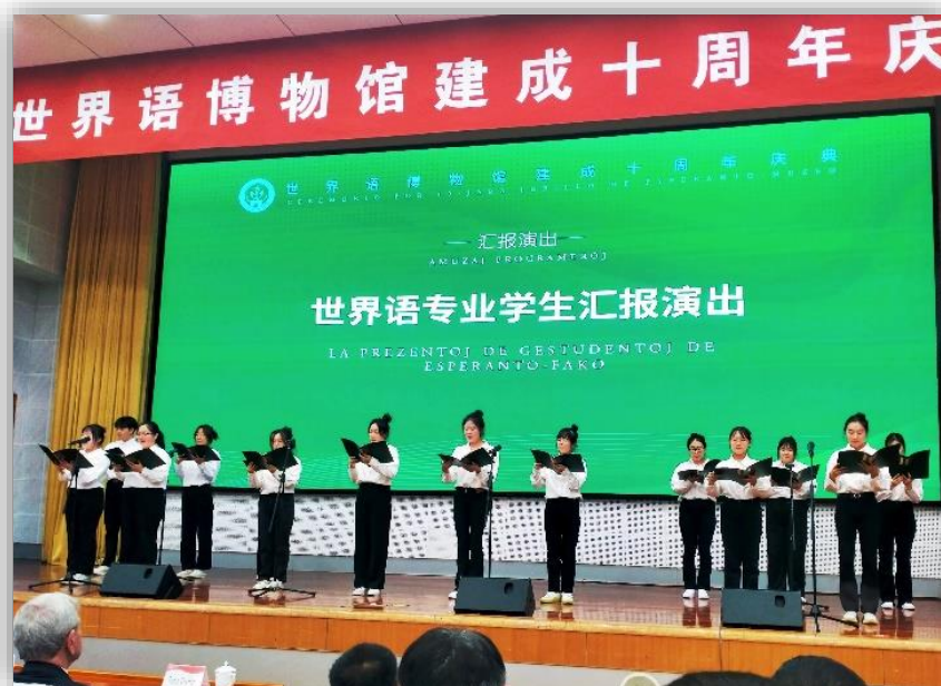
Students of the Esperanto major during the ceremony in December 2023