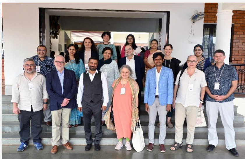
Speakers and organisers