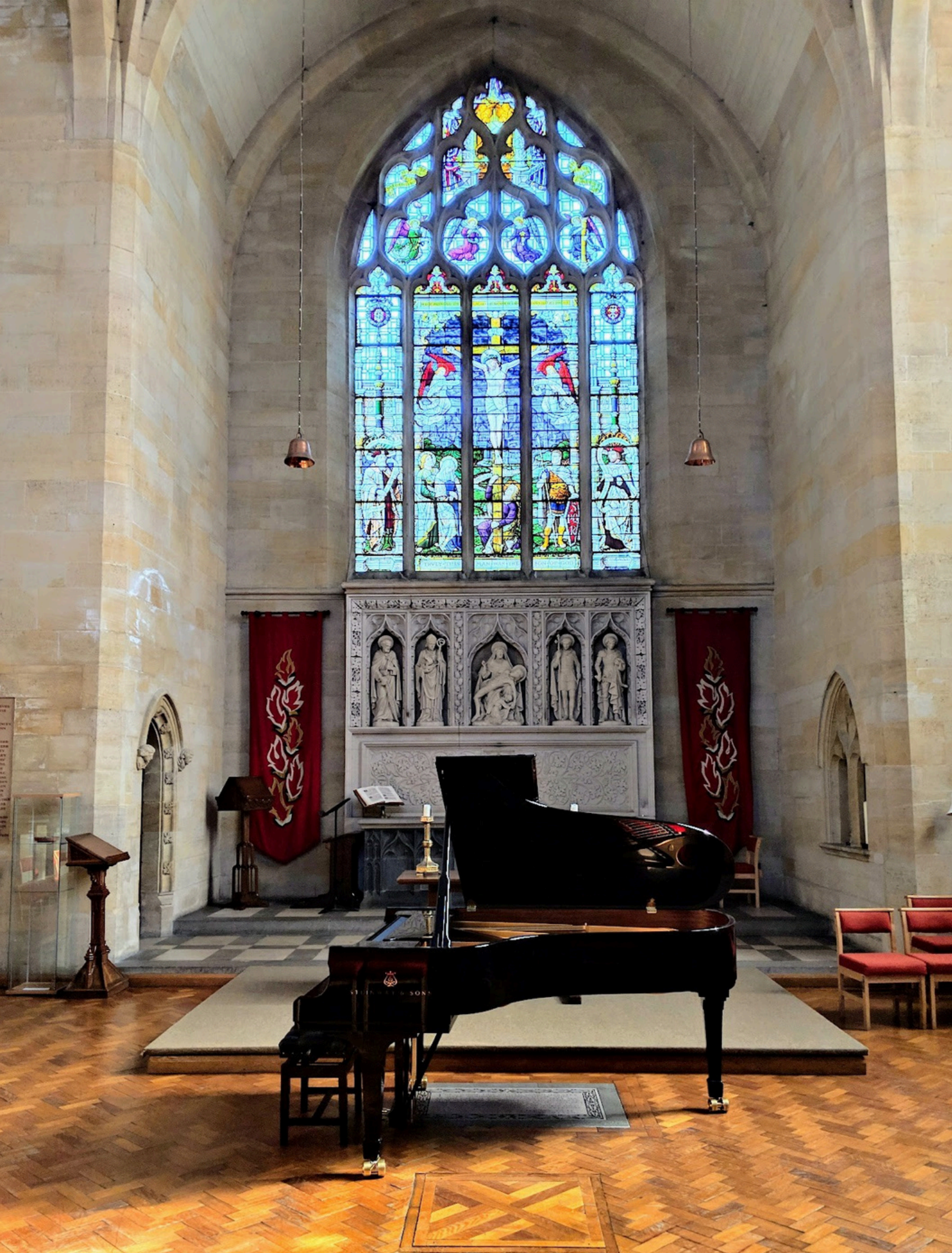
Musiq Group's Steinway Model B piano in the school chapel at Rugby School. This is part of our leased fleet of 17 pianos at Rugby School. Musiq Group also tunes 25 additional pianos owned by Rugby School as part of the lease.