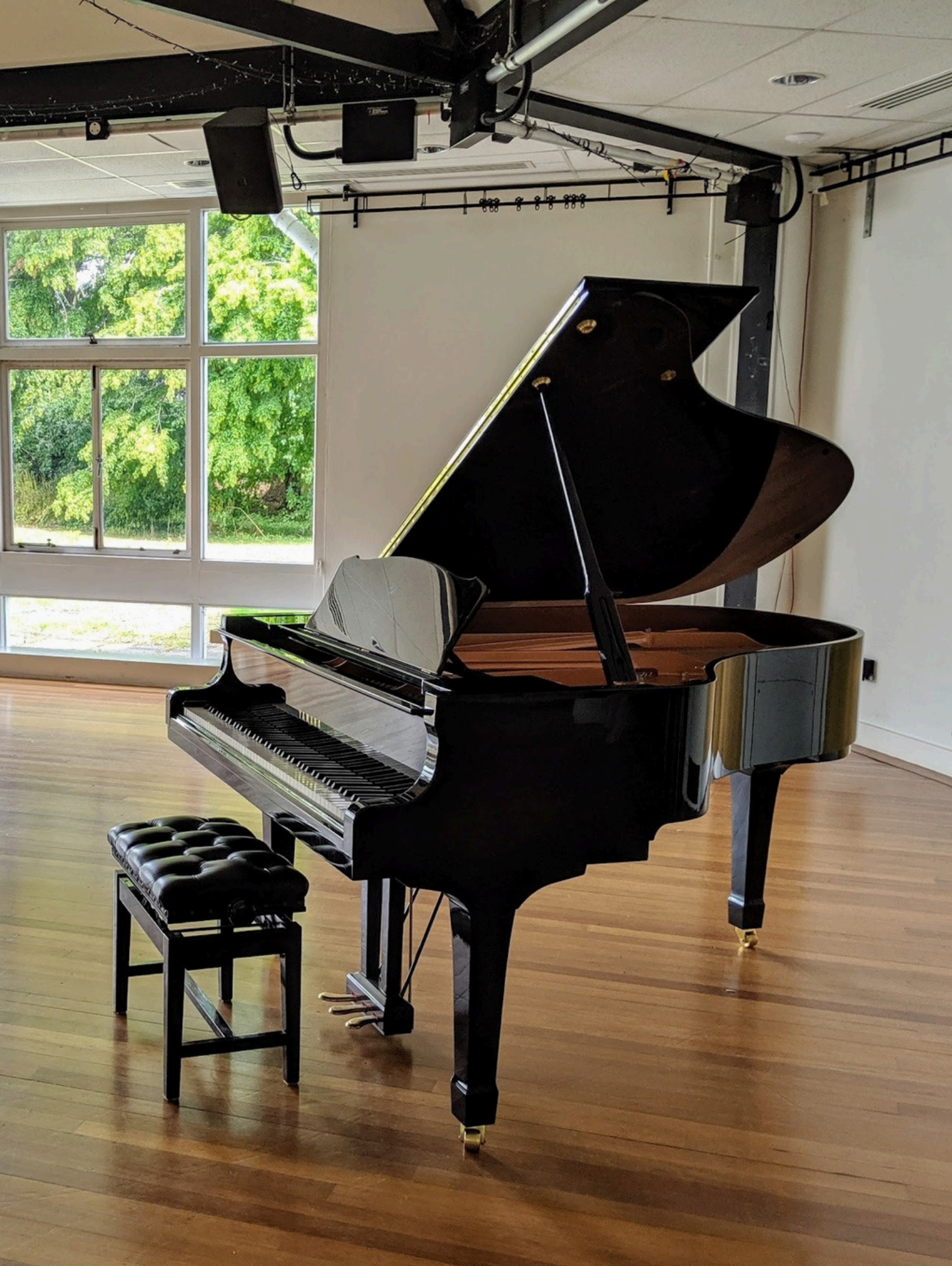
Musiq Group's Yamaha C3 piano on an "event hire" at Dartington Summer School.