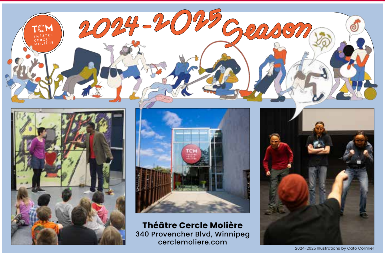
Théâtre Cercle Molière 340 Provencher Blvd, Winnipeg cerclemoliere.com