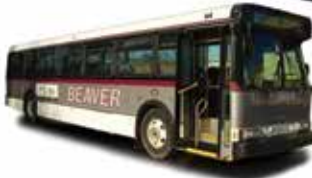
47-Passenger Transit-Style Buses