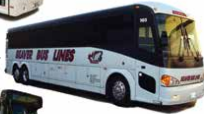
40-Passenger Lounge Coach