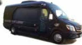
16-Passenger Sprinter Bus

339 Archibald Street, Winnipeg, MB R2J 0W6 www.beaverbus.com info@beaverbus.com Phone: (204) 989-7007 Toll-Free: 1-800-432-5072