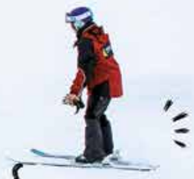
CSIA & CASI Certified Instructors