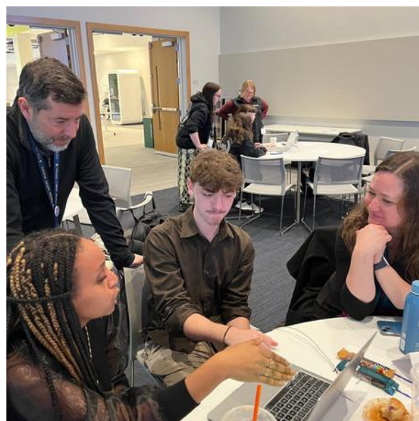
Westbrook JA Titan students had the opportunity to present at JA's Maine Business Hall of Fame, in front of 400-plus state business leaders, November 4, 2024.