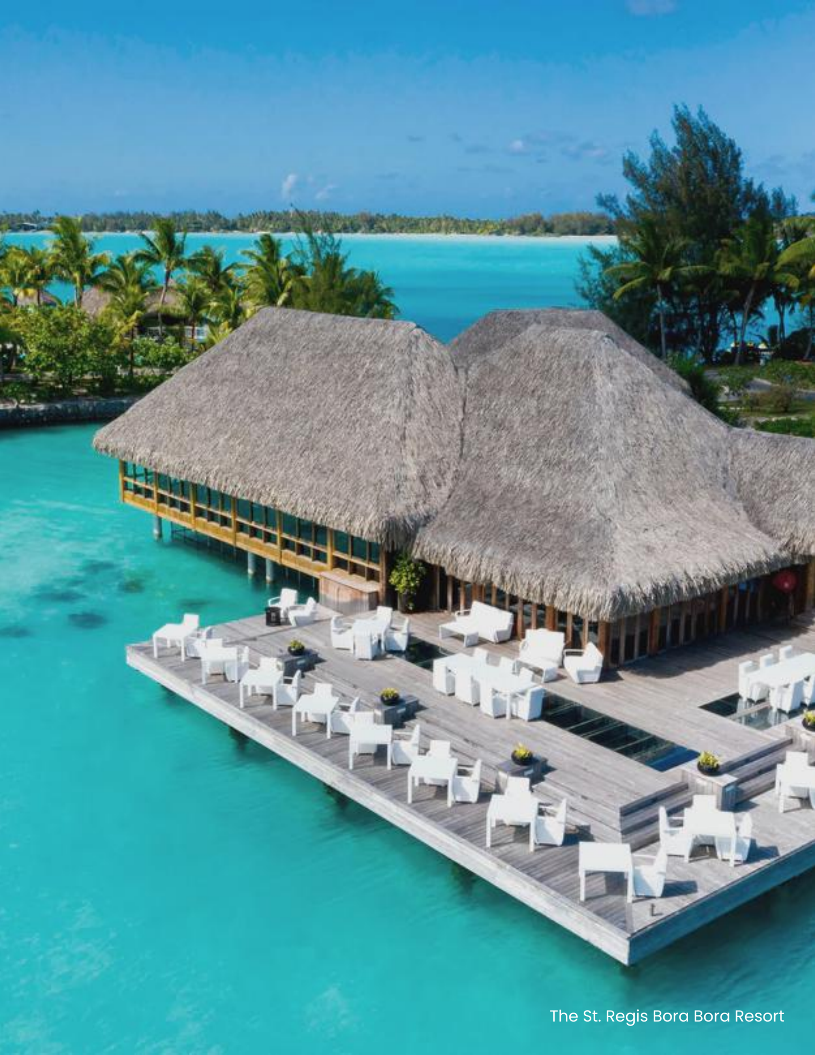
The St. Regis Bora Bora Resort