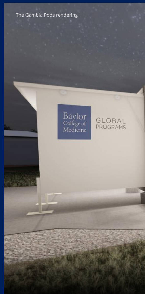
The Gambia Pods rendering

While these innovations and resources empower KGH's physicians with the necessary tools to improve the lives of mothers, clinical training remains equally crucial for lasting impact. KGH is the pilot site of the GOALL Program (The Gambia Obstetrics and Anesthesia Learning and Leadership), which works to provide KGH's physicians with ongoing educational opportunities in the fields of obstetrics and gynecology as well as anesthesiology. The team is committed to a multi-modal approach by combining educational initiatives with capacity building to address complex healthcare topics, such as improving maternal healthcare in The Gambia.