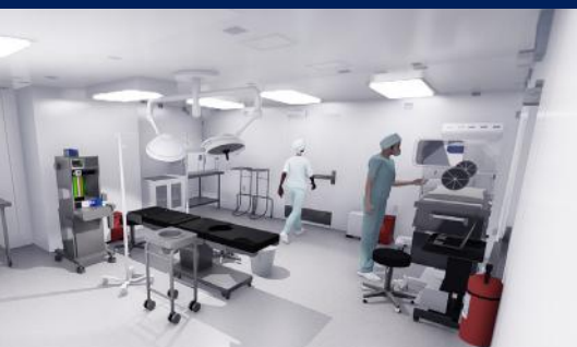
Operating room (first-person view)

KGH is the pilot site of The Gambia Obstetrics and Anesthesia Learning and Leadership Program (GOALL), which works to provide KGH's physicians with ongoing educational opportunities in the fields of OB/GYN and anesthesiology.