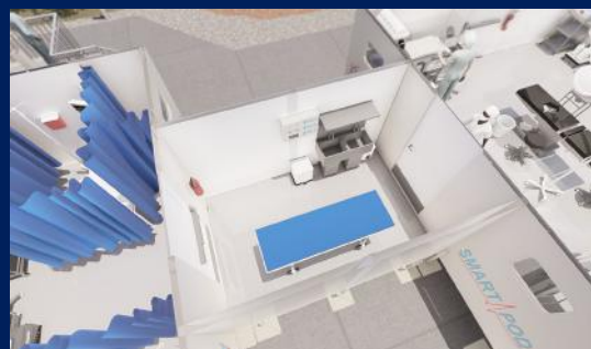
Connecting vestibule serving as a pre-op staging area