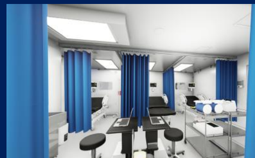
Post-anesthesia care unit (PACU)