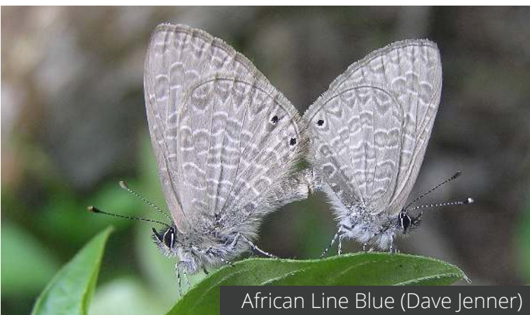
African Line Blue (Dave Jenner)