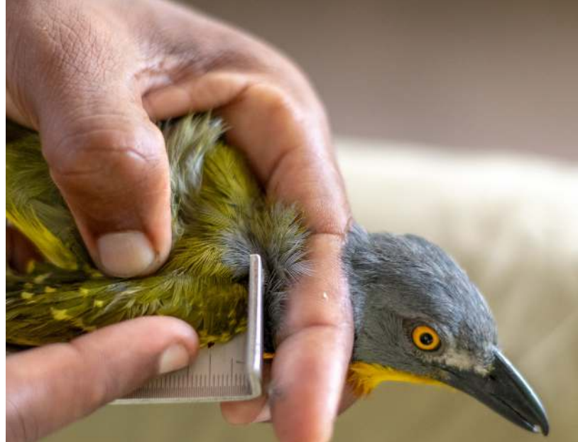
Grey-headed Bushshrike ringed at ARK Conservation Centre