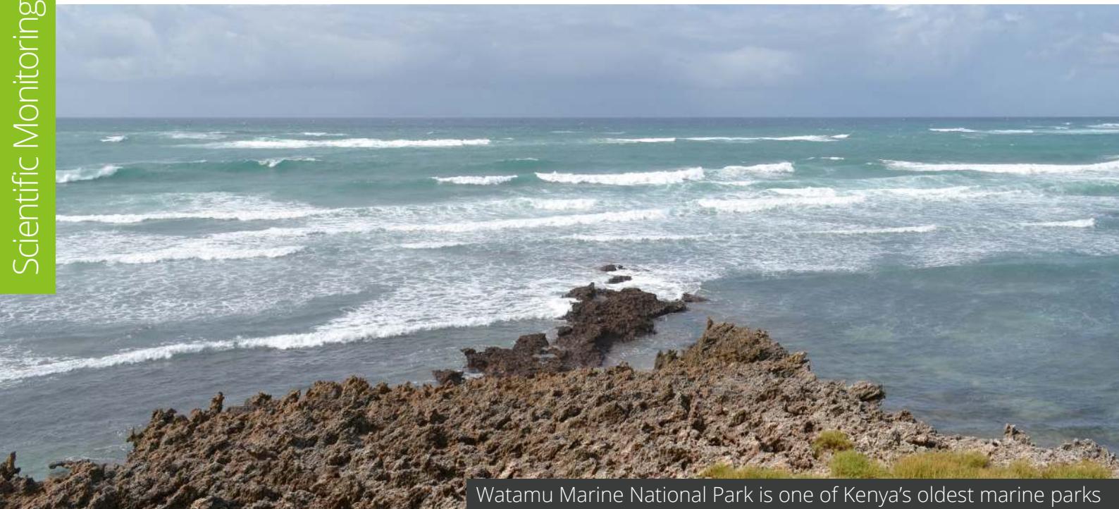
Watamu Marine National Park is one of Kenya's oldest marine parks

The Marine Conservation Programme has continued to work on priority issues previously identified by ARK during biodiversity and habitat surveys in the Watamu Marine National Park (WMNP). In particular, we have focused on three areas of importance for the Park.