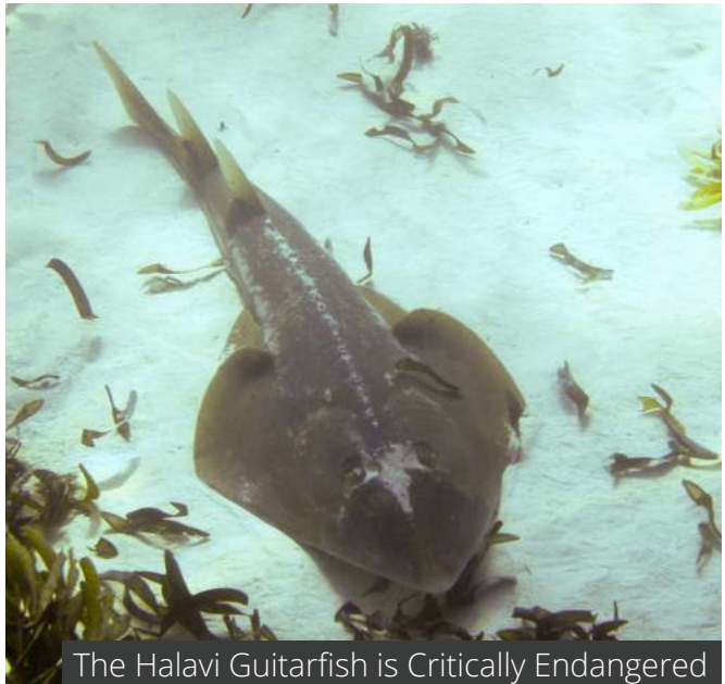
The Halavi Guitarfish is Critically Endangered

To gain better understanding of the abundance and behaviour of sharks and rays in several habitats, we carried out surveys using Baited Remote Underwater Video Stations (BRUVS) and timed snorkelling swims.