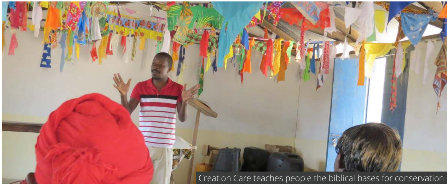
Creation Care teaches people the biblical bases for conservation