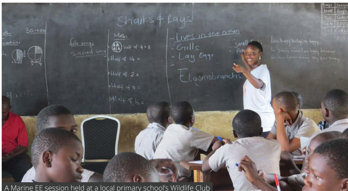
A Marine EE session held at a local primary school's Wildlife Club

Environmental Education (EE) in 2019 concentrated on reaching out to schools in three areas: