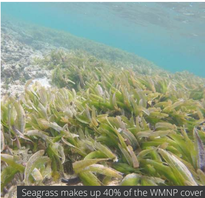
Seagrass makes up 40% of the WMNP cover