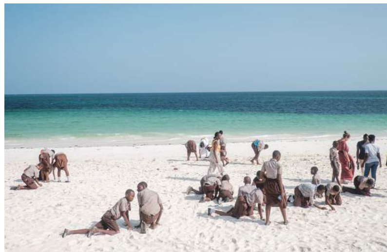
Engaging local students in practical conservation efforts