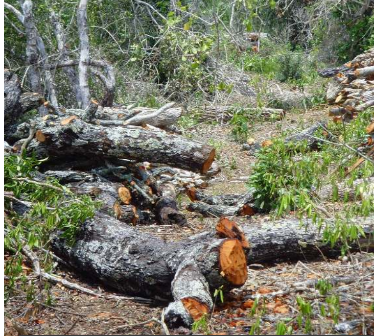
Illegal logging for charcoal threatens the Woodland