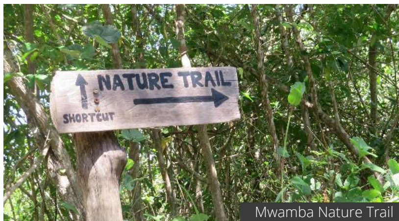
Mwamba Nature Trail