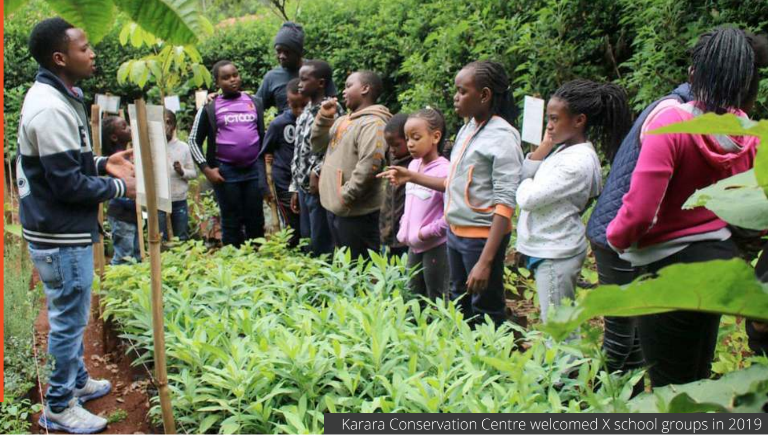
Karara Conservation Centre welcomed X school groups in 2019