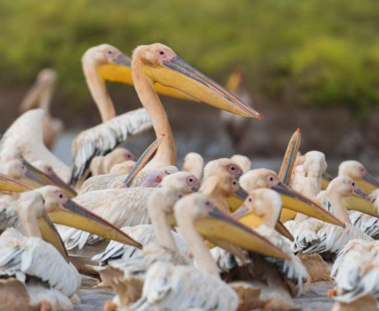
Great White Pelicans, Tana River Waterbird Count