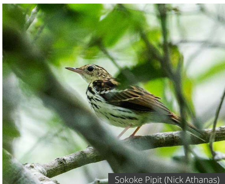
Sokoke Pipit (Nick Athanas)