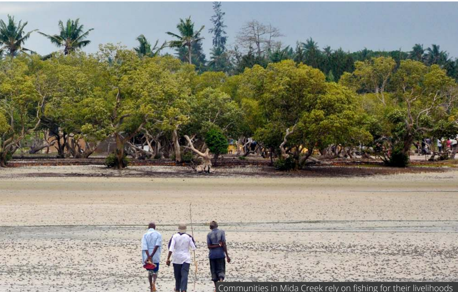
Communities in Mida Creek rely on fishing for their livelihoods