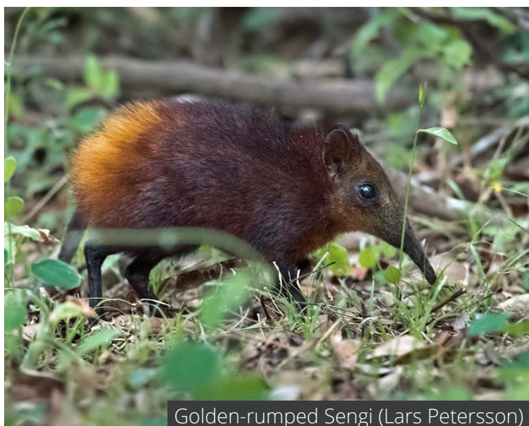
Golden-rumped Sengi (Lars Petersson)

With funding from supporters and donors, ARK has secured 458 ha of forest to safeguard it as a Nature Reserve . This is good progress, yet land purchase efforts must urgently continue as the removal of forest cover is intensifying. The goal is to create a reserve that covers at least 1,800 ha to protect an area large enough to protect viable populations of Sokoke Scops Owls, elephant-shrews and the overall biodiversity in the area.