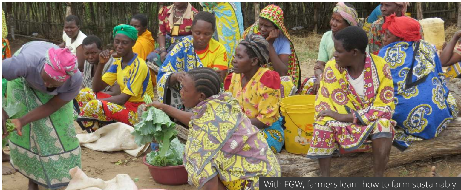
With FGW, farmers learn how to farm sustainably