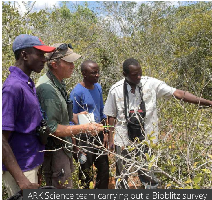
ARK Science team carrying out a Bioblitz survey