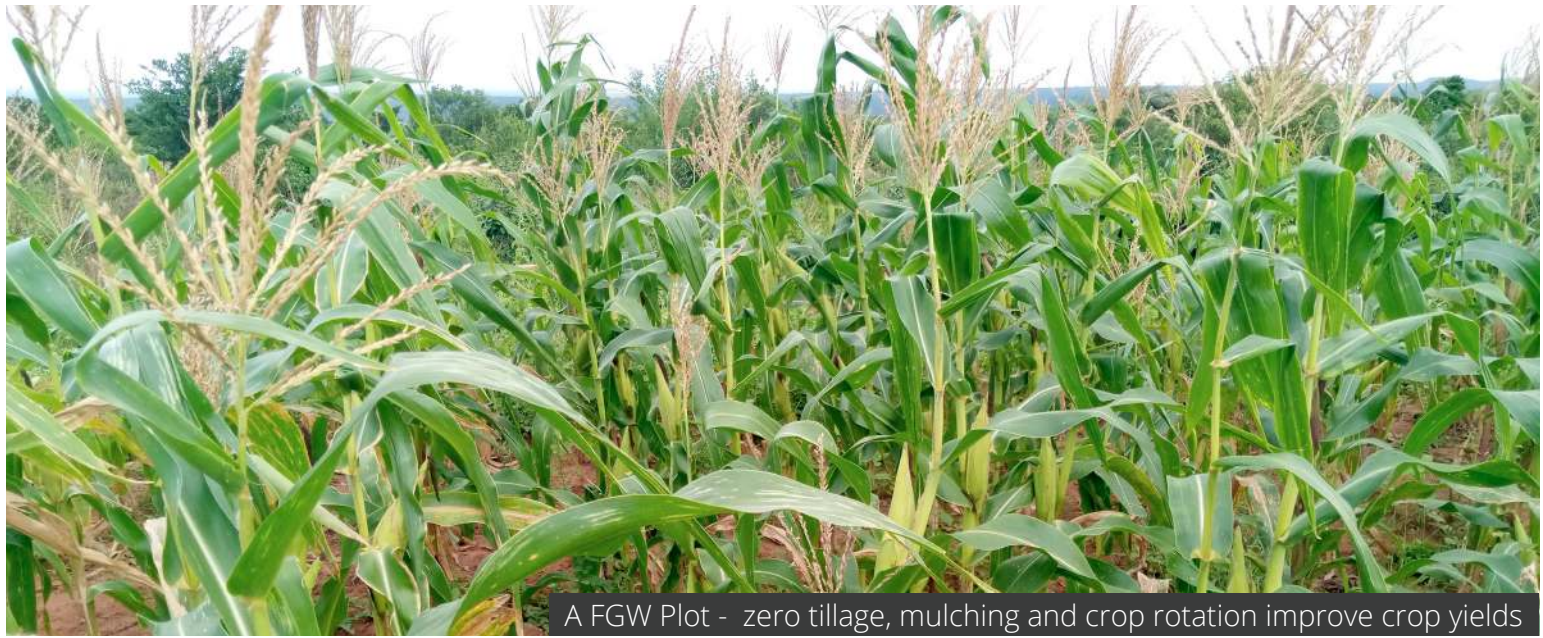
A FGW Plot - zero tillage, mulching and crop rotation improve crop yields