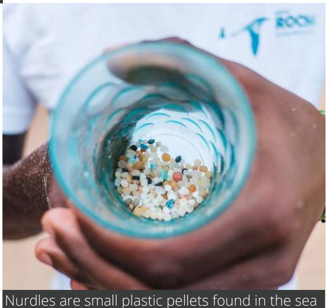
Nurdles are small plastic pellets found in the sea