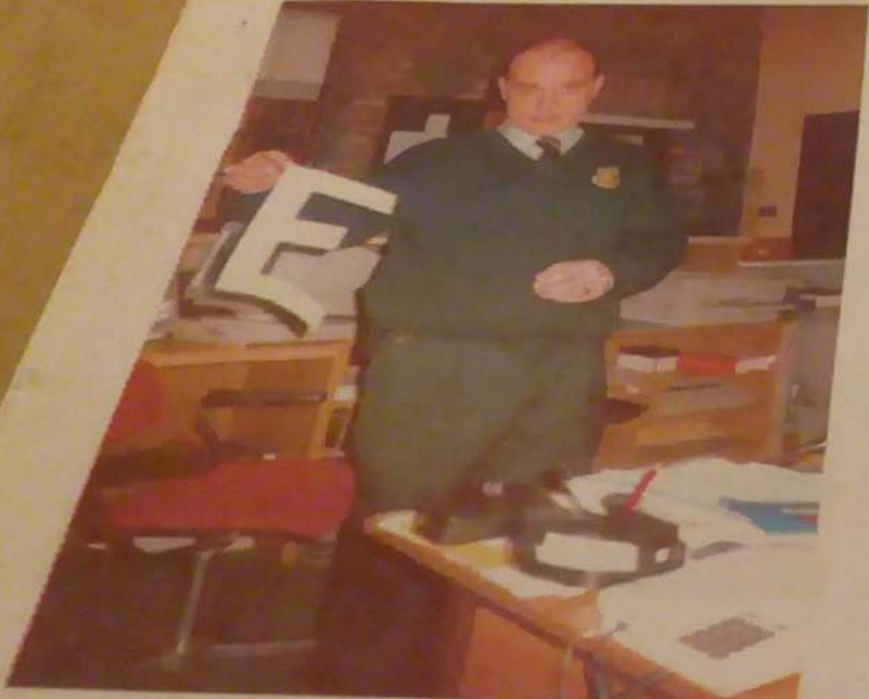
one way to drop "E"

At the end of the first Semester it is not possible to... starts on February 12. In the past, ITD would dedicate a computer lab to run an application for student to look up