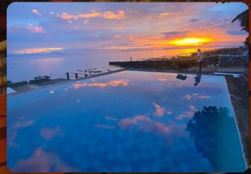
Sunset pool and sea-view atmosphere

Education and progression are part of the appeal as well. Dive education, underwater photography, and more personalized guidance make it a good fit for travelers who want a quiet stay with strong marine life and a more private base in one of the Philippines' best-known dive regions.