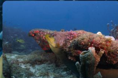
Reef structure and marine life