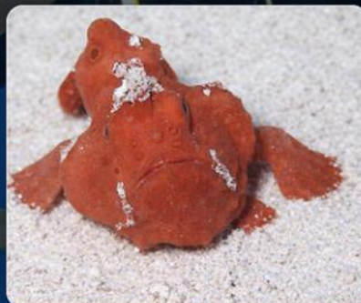
Macro life and sandy detail