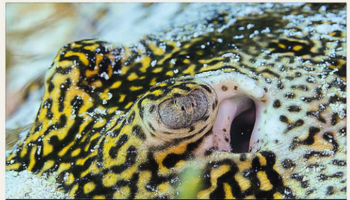
Close-up reef detail and marine life