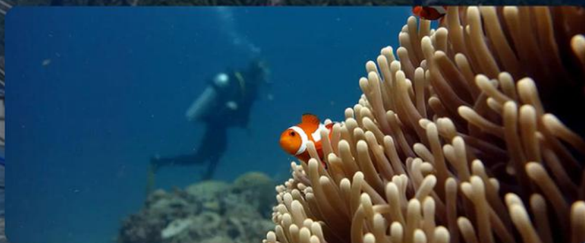
Reef color and marine life detail

For divers who want both professional training and the beauty of El Nido, Palawan Divers brings both sides together.