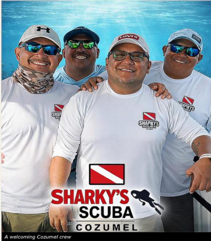
A welcoming Cozumel crew