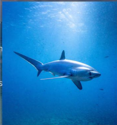
Signature blue-water encounters

For divers drawn to destinations with a strong underwater identity and a laid-back island rhythm, it offers a memorable way to experience this corner of the Philippines.