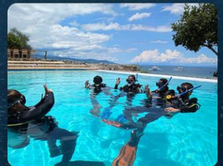
Training and pool practice on site

For divers who want both Moalboal's signature spectacle and a polished seafront base, Cebu Fun Divers is one of the strongest combinations.