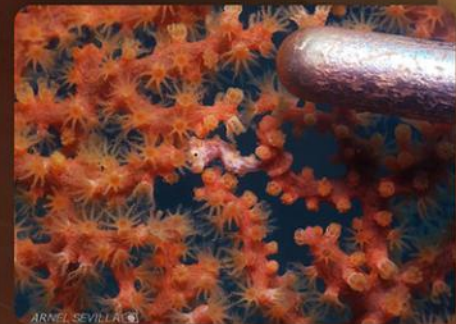
Macro life and photography appeal

For travelers who want quieter Anilao diving with strong macro life and a boutique sea-view stay, Portulano offers a distinct alternative.