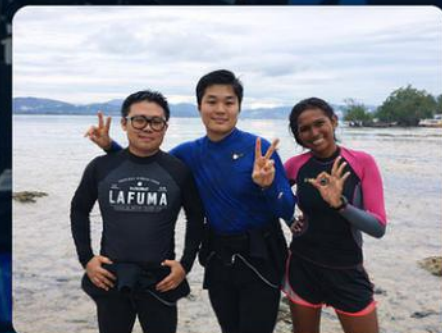
Shore side and friendly local feel

For travelers using Puerto Princesa as a base, Let's Dive Palawan offers one of the easiest ways into the water.