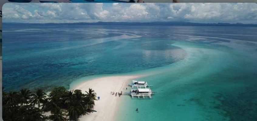
Island scenery and day-trip atmosphere

For travelers who want both iconic shark diving and a relaxed island base, this is one of Malapascua's strongest combinations.