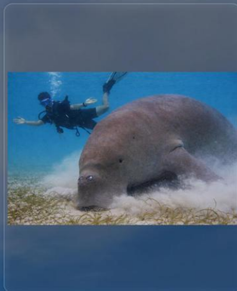
Rare encounters and calm shallows

What makes the setting stand out is El Nido itself - limestone scenery, clear water, reef life, and a strong sense of place above and below the surface. For travelers who want training, scenery, and reef diving in one destination, Palawan Divers offers a strong gateway into northern Palawan.