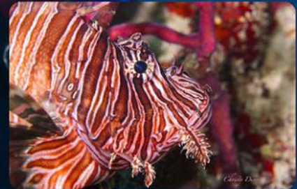
Color and close-up detail

For divers who want more than a quick stop, Stuart works as both a training base and a coastal escape.