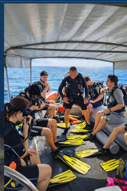
Training and boat-day energy

For certified divers, the experience extends beyond try-dives and courses. Daily boat trips and island diving create an easy way into Puerto Princesa Bay and the wider Palawan coast, giving the destination a practical, welcoming, and well-rounded identity above and below the surface.