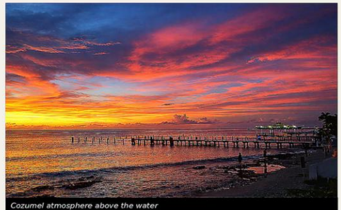
Cozumel atmosphere above the water