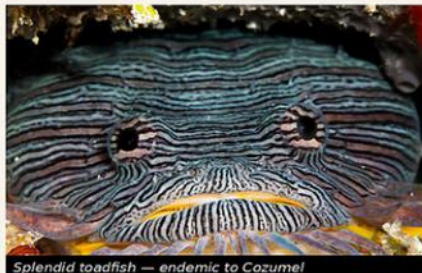
Splendid toadfish — endemic to Cozumel

Some dive operations feel rushed. Sharky's leans the other direction. The experience feels approachable, social, and easy to settle into — the kind of setup that lets travelers enjoy Cozumel without overcomplicating the day. That makes it a strong fit for divers who want great water time, smooth logistics, and a more relaxed connection to the island.