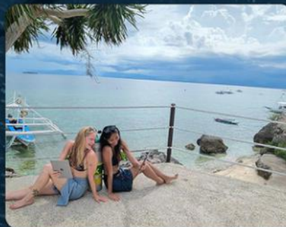
Relaxed resort life above water