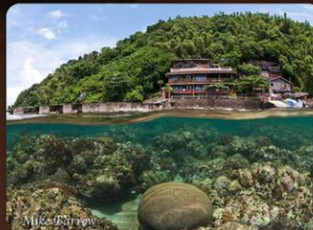
House reef and coastal setting