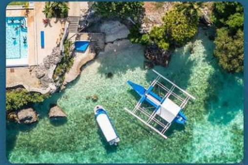
Seafront setting and easy boat access

Education and progression are part of the appeal as well. Cebu Fun Divers offers beginner training, kids' programs, and options to build skills alongside shore dives, boat diving, night diving, and underwater photography-friendly experiences.