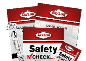
Vehicle Information Package (Standard)