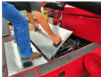
Lightweight Deck Lids Provide Easy Access to Drivetrain & Hydraulics