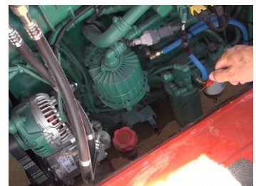
Easily Accessible Daily Checks