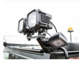
10 LED Work Lights (Standard)