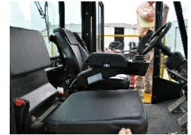
Fully Adjustable Air Ride Seat (Available Trainer Seat)