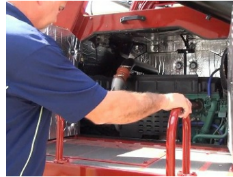
Service & Inspections from Running Board Large Bay Doors Provide Full Access