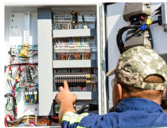
Easy Access to Heavy Duty Circuit Breaker Panel and Breaker Reset Switches